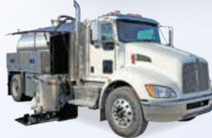
Used T370 Kenworth GREASE TRUCK

300 HP, Allison Auto, 33,000 (G.V.W.R.) 1800 gallon stainless steel (ITI) tank, NVE 607 ProMax package, heat collars (heat through tank), heated cabinet for ProVac unit w/hydraulic lift, Hannay hose reel w/100' 2" hose in heated cabinet.