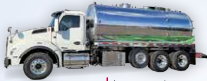
2023 T880 Kenworth Decant (200/4000/1400) NVE 4310, CALL FOR PRICING CAT jetter package