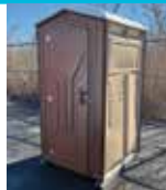
57 brown and tan Satellite Tuffway portable toilets. All in good rental condition with over 1,500 of these units sold. These will sell fast at just $200.00 each. Customer is responsible for transport from N.Y. 800-634-2085 (P02)

LIST YOUR TRUCKS & EQUIPMENT FOR SALE! www.pumper.com/classifieds/place_ad