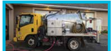
2019 Isuzu NPR. Flowmark. 900 waste/300 fresh. Approx 100,000 miles. Has onboard gas pressure washer. 45-gallon poly tank on passenger side. Everything works as it should. Truck is route ready. Tires are good. Located in New Jersey 07922. Call or text 908-337-1390. $54,000.00 (P01)