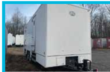
2016 Jag (10) station restroom trailer, cottage series,(5) ladies rooms with flushing toilets, common area with vanity, mirror and (2) sinks. (2) men's rooms with flushing toilets, common area with (3) urinals, (2) sinks with mirrors, hot water and winterization package. Call 845-883-7880. (P01)

Two 2008 JAG porta-lisa 2 stall units. One 2008 JAG porta-lisa 4 stall unit. One 2011 JAG 8 stall unit for sale. Will sell as a package for $60,000.00 or can sell independently. All units in nice shape and rentable condition. One 2019 F350 with a 250/200 Presvac tank, 125k miles. One 2016 Isuzu Workmate with a 600/300 tank, 235 miles, new transmission and PTO. $50,000.00 each. Please call 610-462-0034. (P01)