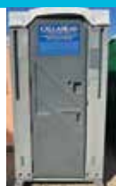
95 orange and gray Satellite Hi-Tech portable toilets. Strongest unit ever produced. All in rental condition. Over 1,000 sold coast to coast. Customer responsible for transport from N.Y. $150.00 per unit. 800-634-2085 (P02)