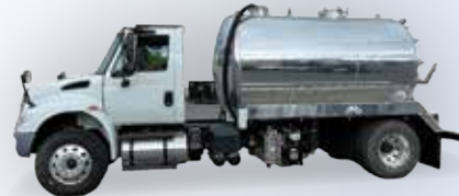
2015 International 4300 ISB250/250HP Cummins, Allison 2500 RDS, 12/21, 2,650 gallon aluminum tank, NVE 607 package