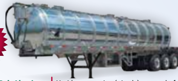
7000 - 9000 Gal. Aluminum Tri-Axle Trailers Air ride suspension (tri-axle), pump platform, bright finish, LED lights, Betts valves.