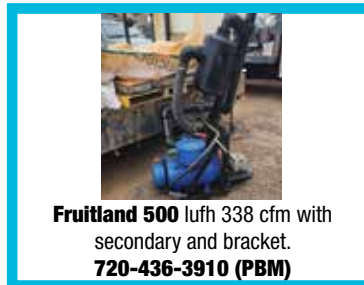
Fruitland 500 lufh 338 cfm with secondary and bracket. 720-436-3910 (PBM)

Buy & Sell all makes and models, new & used vacuum pumps, blowers, high-pressure water pumps, new and good used replacement parts. Buy discounted pumps online 24/7. Call us for a current inventory list. www.VacuumSalesInc.com, (888) VAC-UNIT (822-8648). (PBM)