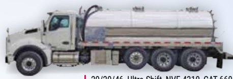
2023 Kenworth T880 | 20/20/46, Ultra-Shift, NVE 4310, CAT 660 jetter package, LED lights, LED strobes, 4-camera package, NAV system, alum. tank CALL FOR PRICING