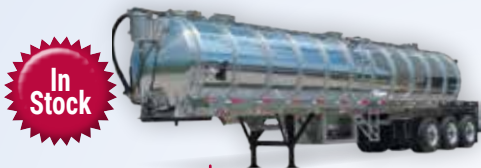
In Stock 7000 - 9000 Gal. Aluminum Tri-Axle Trailers | Air ride suspension (tri-axle), pump platform, bright finish, LED lights, Betts valves.