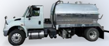
2015 International 4300 ISB250/250HP Cummins, Allison 2500 RDS, 12/21, 2,650 gallon aluminum tank, NVE 607 package