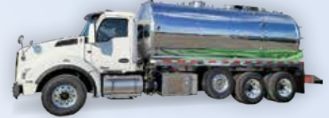
2023 T880 Kenworth Decat | (200/4000/1400) NVE 4310, CAT jetter package CALL FOR PRICING