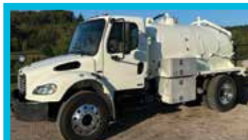
2005 Freightliner, Mercedes 7.2 liter, 33k gww, 500k miles, 3000 series Allison auto, AC, cruise, 1600 gal stainless steel tank, 1000/300/300, NVE 304 vac pump, new paint and alum wheels. This truck runs and drives great. Finance and delivery available, $29,000.00 Hulls Truck Bodies LLC 740-820-5338 (P11)