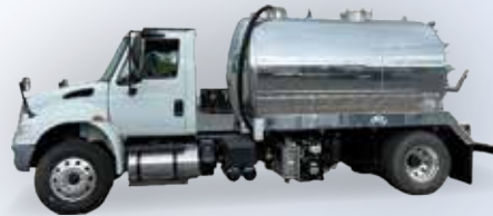
2015 International 4300 ISB250/250HP Cummins, Allison 2500 RDS, 12/21, 2,650 gallon aluminum tank, NVE 607 package

300 HP, Allison Auto, 33,000 (G.V.W.R.) 1800 gallon stainless steel (IT) tank, NVE 607 ProMax package, heat collars (heat through tank), heated cabinet for ProVac unit w/hydraulic lift, Hannay hose reel w/100' 2" hose in heated cabinet.