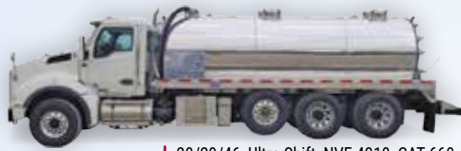
2023 Kenworth T880 CALL FOR PRICING 20/20/46, Ultra-Shift, NVE 4310, CAT 660 jetter package, LED lights, LED strobes, 4-camera package, NAV system, alum. tank