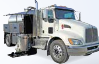
Used 2021 T370 Kenworth GREASE TRUCK

300 HP, Allison Auto, 33,000 (G.V.W.R.) 1800 gallon stainless steel (IT) tank, NVE 607 ProMax package, heat collars (heat through tank), heated cabinet for ProVac unit w/hydraulic lift, Hannay hose reel w/100' 2" hose in heated cabinet.