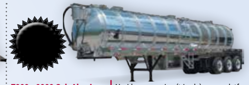
7000 - 9000 Gal. Aluminum Tri-Axle Trailers Air ride suspension (tri-axle), pump platform, bright finish, LED lights, Betts valves.