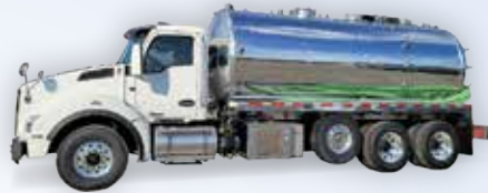
2023 T880 Kenworth Decat CALL FOR PRICING (200/4000/1400) NVE 4310, CAT jetter package