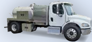
2023 Freightliner GREASE TRUCK | NVE 607, Heated ProVac cabinet, 950 SS tank NON-CDL