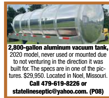
2,800-gallon aluminum vacuum tank , 2020 model, never used or mounted due to not venturing in the direction it was built for. The specs are in one of the pictures. $29,950. Located in Noel, Missouri. Call 479-619-8226 or statelinesepctic@yahoo.com. (P08)