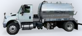
2015 International 4300 IN PRODUCTION | ISB250/250HP Cummins, Allison 2500 RDS, 12/21, 2,650 gallon aluminum tank, NVE 607 or B500 package