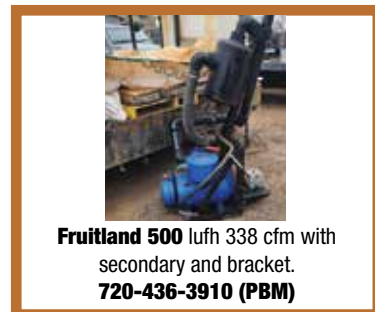
Fruitland 500 lufh 338 cfm with secondary and bracket. 720-436-3910 (PBM)

Buy & Sell all makes and models, new & used vacuum pumps, blowers, high-pressure water pumps, new and good used replacement parts. Buy discounted pumps online 24/7. Call us for a current inventory list. www.VacuumSalesInc.com, (888) VAC-UNIT (822-8648). (PBM)