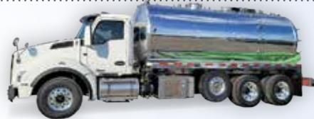
2023 T880 Kenworth Decant CALL FOR PRICING | (200/4000/1400) NVE 4310, CAT jetter package