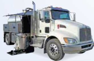
Used 2021 T370 Kenworth GREASE TRUCK

300 HP, Allison Auto, 33,000 (G.V.W.R.) 1800 gallon stainless steel (ITI) tank, NVE 607 ProMax package, heat collars (heat through tank), heated cabinet for ProVac unit w/hydraulic lift, Hannay hose reel w/100' 2" hose in heated cabinet.