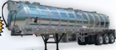
7000 - 9000 Gal. Aluminum Tri-Axle Trailers | Air ride suspension (tri-axle), pump platform, bright finish, LED lights, Betts valves.