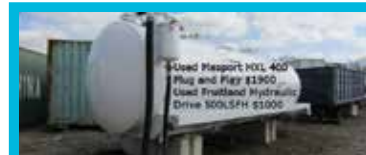
Used VAC Tanks. 2500 to 4700-gallon - Starting at $7,900. Gasco Triplex 3364-AL 269-751-5167. (PBM)

Submit your classified ad online! www.pumper.com/classifieds/place_ad