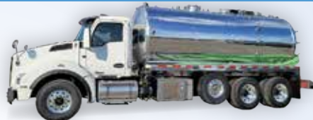
2023 T880 Kenworth Decant CALL FOR PRICING

20/20/46, Ultra-Shift, NVE 4310, CAT 660 jetter package, LED lights, LED strobes, 4-camera package, NAV system, alum. tank