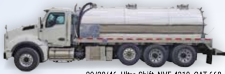
2023 Kenworth T880 CALL FOR PRICING

20/20/46, Ultra-Shift, NVE 4310, CAT 660 jetter package, LED lights, LED strobes, 4-camera package, NAV system, alum. tank