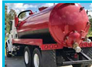
Complete Steel Vacuum Tanks available 800-5,000-gallon. All prices are not the same. We deliver anywhere. J Eagle Tanks 800-721-2774 www.Jeagletanks.com (PBM)

Tanks in stock and available for immediate purchase. Prices start at $16,000 for a 2500-gallon tank. Complete and ready to place on your truck. Call J Eagle Tanks 1-800-721-2774 (PBM)