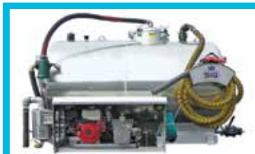
Slide In Queen has units ready to ship. Call us today at 833-4-SLIDEIN (475-4334). 300-1,500-gallon, ready to work, units for your portable restroom, septic or grease business. Contact us today! 833-4-SLIDEIN (475-4334) CO (P07)