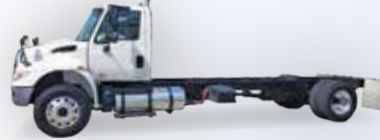
2015 International 4300 IN PRODUCTION

Air ride suspension (tri-axle), pump platform, bright finish, LED lights, Betts valves.