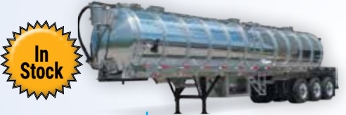
7000 - 9000 Gal. Aluminum Tri-Axle Trailers

NVE 607, Heated ProVac cabinet, 950 SS tank NON-CDL