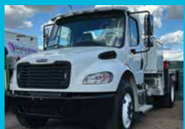
2022 Brand New Freightliner

Need Equipment? Contact Us We Can Get It.