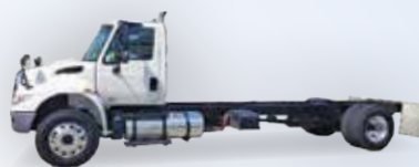
2015 International 4300 IN PRODUCTION | ISB250/250HP Cummins, Allison 2500 RDS, 12/21, 2,650 gallon aluminum tank, NVE 607 or B500 package