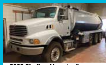
2006 Sterling , Mercedes Benz powered, 10 speed Eaton Fuller transmission only 61,217 miles. Imperial tank with hydraulic lift and full rear open door. 3700 waste and 300 fresh water for jetter / washdown with CAT pump. Has NVE 743 Blower Pump which is great for pumping car washes, catch basins and hydro excavating. Well maintained and always parked indoors. $98,000 920-585-9924 (P03)