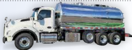
2023 T880 Kenworth Decant CALL FOR PRICING | (200/4000/1400) NVE 4310, CAT jetter package