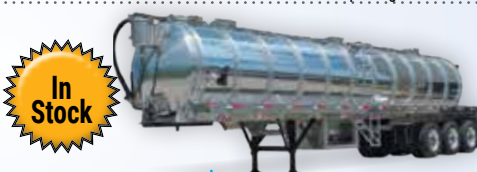
7000 - 9000 Gal. Aluminum Tri-Axle Trailers | Air ride suspension (tri-axle), pump platform, bright finish, LED lights, Betts valves.