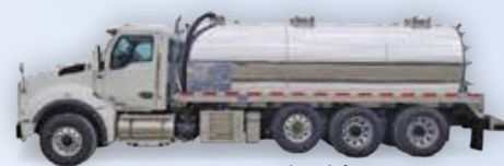
2023 Kenworth T880 CALL FOR PRICING | 20/20/46, Ultra-Shift, NVE 4310, CAT 660 jetter package, LED lights, LED strobes, 4-camera package, NAV system, alum. tank