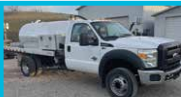
2011 F450 porta pot truck, 6.7 powerstroke, 33k on new engine, Allison auto, AC, cruise, 1000 gal alum Progress tank, 700/300, masport vac pump, 2 pot rack, nice running truck. Financing and delivery available, $27,000.00 Hull's Truck Bodies LLC 740-820-5338 (P02)