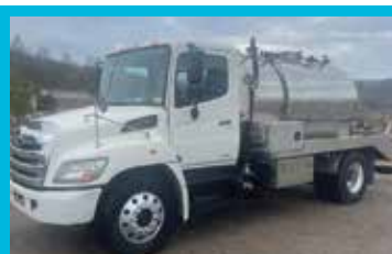
2011 Hino 338, porta pot truck, J08E diesel, 290k, auto trans, 33k gvw, AC, cruise, 2000 gal stainless tank, 1500/500, masport vac pump, fresh water pump. Very clean, great running truck. Financing and delivery available, $55,000.00 Hull's Truck Bodies 740-820-5338 (P03)