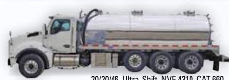
2023 Kenworth T880 | 20/20/46, Ultra-Shift, NVE 4310, CAT 660 jetter package, LED lights, LED strobes, 4-camera package, NAV system, alum. tank CALL FOR PRICING