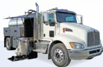
Used 2021 T370 Kenworth GREASE TRUCK

300 HP, Allison Auto, 33,000 (G.V.W.R.) 1800 gallon stainless steel (ITI) tank, NVE 607 ProMax package, heat collars (heat through tank), heated cabinet for ProVac unit w/hydraulic lift, Hannay hose reel w/100' 2" hose in heated cabinet.