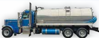
2006 Peterbilt | CAT engine, manual transmission, NVE pump READY FOR WORK 367 pump package, 4,000 gallon aluminum tank