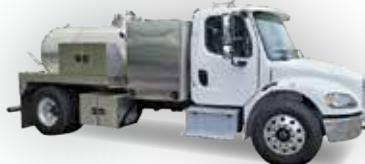
2023 Freightliner | NVE 607, Heated ProVac cabinet, 950 SS tank GREASE TRUCK NON-CDL