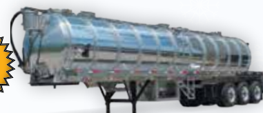
7000 - 9000 Gal. Aluminum Tri-Axle Trailers | Air ride suspension (tri-axle), pump platform, bright finish, LED lights, Betts valves.