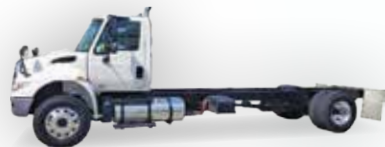
2015 International 4300 | ISB250/250HP Cummins, Allison 2500 RDS, 12/21, 2,650 gallon aluminum tank, NVE 607 or B500 package IN PRODUCTION