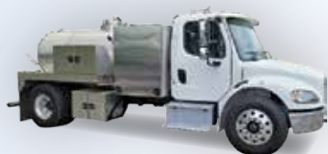
2023 Freightliner GREASE TRUCK | NVE 607, Heated ProVac cabinet, 950 SS tank NON-CDL