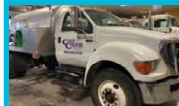
2015 Ford F750 portable restroom truck with Arthur custom built aluminum tank 1500 waste / 500 fresh. Tank was built by FlowMark in 2014. Truck has a Cum- mins engine 1SX15 with 146,105 miles on it. We have added a new unit hauler, hose reel, DC-10 wash down pump, new wiring and control box for the pto, lights and water. Vac pump is a Masport HXL4. 26000 gvw truck. Truck is local pick up only in Manhattan Kansas. Priced to sell at $70,000. Call 785-564-2723 or email catcansofmanhattan@gmail. com (P10)

Submit your classified ad online! www.pumper.com/classifieds/place_ad