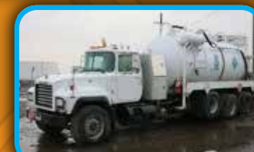
(0514C) Pre-owned 2000 Mack RD686S cab and chassis with a 4,000 U.S. gallon, carbon steel, D.O.T. certified, vacuum tank unit.