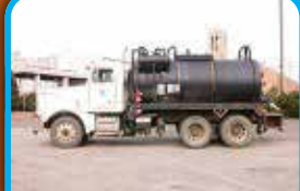
(6625C) 1997 Peterbilt 378 cab & chassis with a Presvac 3,000 U.S. gallon, carbon steel, vacuum tank & Masport HXL15WV water cooled pump.