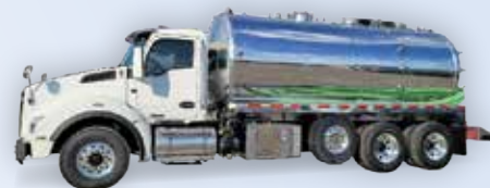
2023 T880 Kenworth Decant CALL FOR PRICING | (200/4000/1400) NVE 4310, CAT jetter package