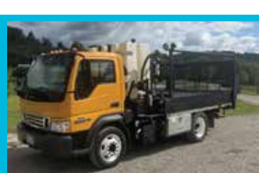
2006 Ford, LCF, Porta Pot truck, 4.5 liter Powerstroke, Allison Auto, 98k miles, AC, cruise, under cdl, Crescent 650 gal waste tank, 350 fresh water tank, 6 pot bed with lift gate, Masport vac pump, freshwater pump and reel. Very clean, great running truck. Financing and delivery available, $35,000.00. Hull's Truck Bodies, LLC 740-820-5338 (P10)

Pre Owned 1993 Mack RD688S cab and chassis with a 3,200 U.S. Gallon, carbon steel, dump type, vacuum tank unit. Stock# 4296C www.VacuumSalesInc.com, (888) VAC-UNIT (822-8648). (PBM)