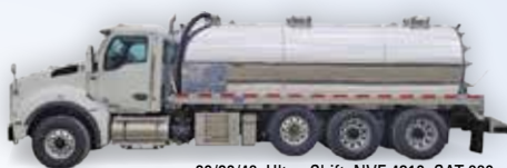
2023 Kenworth T880 CALL FOR PRICING | 20/20/46, Ultra-Shift, NVE 4310, CAT 660 jetter package, LED lights, LED strobes, 4-camera package, NAV system, alum. tank