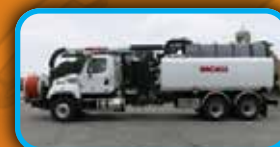
(057R) 2021 Freightliner 114SD cab & chassis with a VACALL AJV1215 combina- tion jet/vac with 12 cubic yard debris and 1,500 gallons of water with a Roots 824 blower & general MWSR50 water pump.