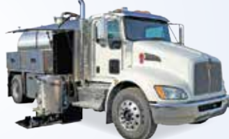
Used 2021 T370 Kenworth GREASE TRUCK

300 HP, Allison Auto, 33,000 (G.V.W.R.) 1800 gallon stainless steel (ITI) tank, NVE 607 ProMax package, heat collars (heat through tank), heated cabinet for ProVac unit w/hydraulic lift, Hannay hose reel w/100' 2" hose in heated cabinet.