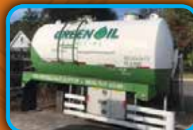
(2500C) Pre-owned 2,500 U.S. gallon, carbon steel, vacuum tank.