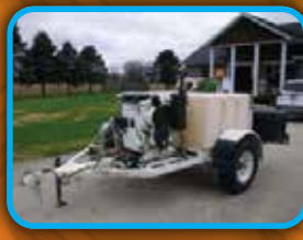
(1386V) 2001 Harben DTH-300 jet trailer with a Harben radial piston diaphragm pump 16 GPM @ 4,000 PSI driven by a Hatz diesel engine.