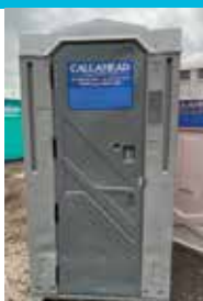
200 Gray & Orange Satellite High Tech Units for sale. All in rentable condition. Customer is responsible for pick up or shipping from NY. $315.00 each. Call 1-800-634-2085 (P11)

Used Portable Toilets for Sale, All in Rentable Condition. 50 Orange/Grey Satellite High-tech, 50 Grey PolyPortable Integra, 50 Tan PolyPortable Integra. $250 each. Customer is Responsible for Pick-up/Shipping in NY. Please contact (800) 634-2085 (P10)