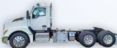
2023 T680 Kenworth CALL FOR PRICING | NVE 4310 blower, full wet system w/hydraulic cooler

300 HP, Allison Auto, 33,000 (G.V.W.R.) 1800 gallon stainless steel (ITI) tank, NVE 607 ProMax package, heat collars (heat through tank), heated cabinet for ProVac unit w/hydraulic lift, Hannay hose reel w/100' 2" hose in heated cabinet.