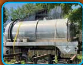
(1852V) Pre-owned 2,800 U.S. gallon, aluminum vacuum