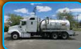
(2897C) 2006 IH 9200i with sleeper and Progress 2,850 U.S. gallon, aluminum, D.O.T. 412 certified, vacuum tank with Wittig RFL100 vacuum pump and 3" transfer pump.