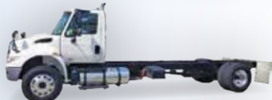
2015 International 4300 IN PRODUCTION | ISB250/250HP Cummins, Allison 2500 RDS, 12/21, 2,650 gallon aluminum tank, NVE 607 or B500 package