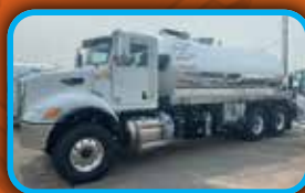
(14007) New 4,000 U.S. gallon, aluminum, vacuum tank. Mounted on a 2023 Peterbilt 548 cab and chassis with a NVE Challenger 887 vacuum pressure pump package.