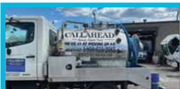
2009 Best Enterprises Built Stainless Steel Tank with Skirting and Conde SDS series pump. Tank in brand new condition and ready to mount. 1050 total gallons, 750 waste and 300 water. This set up brand new costs $36,000. We have SIX of them for sale for $19,900. Contact us at 1 800 634 2085 in New York. (P11)