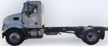
2023 Mack MD | Non-CDL, CALL FOR PRICING Allison Auto