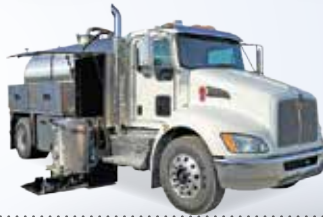
Used 2021 T370 Kenworth GREASE TRUCK

300 HP, Allison Auto, 33,000 (G.V.W.R.) 1800 gallon stainless steel (ITI) tank, NVE 607 ProMax package, heat collars (heat through tank), heated cabinet for ProVac unit w/hydraulic lift, Hannay hose reel w/100' 2" hose in heated cabinet.