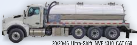
2023 Kenworth T880 CALL FOR PRICING | 20/20/46, Ultra-Shift, NVE 4310, CAT 660 jetter package, LED lights, LED strobes, 4-camera package, NAV system, alum. tank