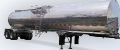
2018 9000 Gallon Tandem Trailer | 93,000 GVWR transport (aluminum tank insulated stainless steel wrapped) 6" discharge