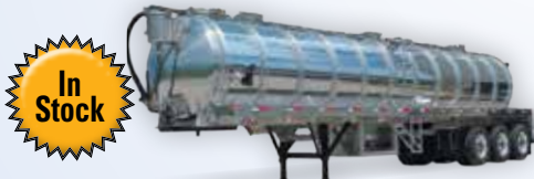
7000 - 9000 Gal. Aluminum Tri-Axle Trailers | Air ride suspension (tri-axle), pump platform, bright finish, LED lights, Betts valves.

300 HP, Allison Auto, 33,000 (G.V.W.R.) 1800 gallon stainless steel (ITI) tank, NVE 607 ProMax package, heat collars (heat through tank), heated cabinet for ProVac unit w/hydraulic lift, Hannay hose reel w/100' 2" hose in heated cabinet.