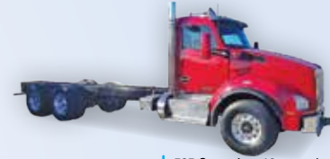
2016 T880 Kenworth | 525 Cummins, 18-speed, IN STOCK 225,000 miles, 20/26-air