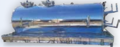
NEW Tank | 2000 (500/1500) dual vacuum tank built for grease CALL FOR PRICING trap and waste fryer oil collection 120" CA required.