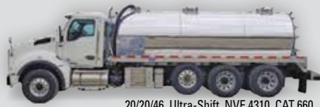
2023 Kenworth T880 | 20/20/46, Ultra-Shift, NVE 4310, CAT 660 CALL FOR PRICING jetter package, LED lights, LED strobes, 4-camera package, NAV system, alum. tank