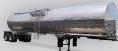
2018 9000 Gallon Tandem Trailer | 93,000 GVWR transport (aluminum tank insulated stainless steel wrapped) 6" discharge