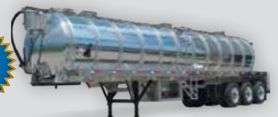
7000 - 9000 Gal. Aluminum Tri-Axle Trailers | Air ride suspension (tri-axle), pump platform, bright finish, LED lights, Betts valves.