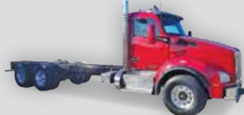
2016 T880 Kenworth | 525 Cummins, 18-speed, IN STOCK 225,000 miles, 20/26-air