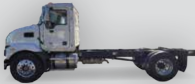
2023 Mack MD | Non-CDL, CALL FOR PRICING Allison Auto