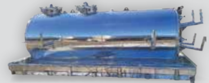
NEW Tank | 2000 (500/1500) dual vacuum tank built for grease CALL FOR PRICING trap and waste fryer oil collection 120" CA required.