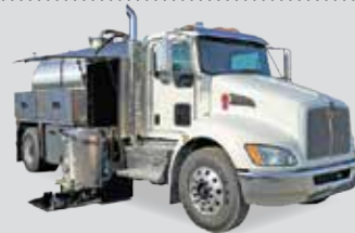
Used 2021 T370 Kenworth GREASE TRUCK

300 HP, Allison Auto, 33,000 (G.V.W.R.) 1800 gallon stainless steel (ITI) tank, NVE 607 ProMax package, heat collars (heat through tank), heated cabinet for ProVac unit w/hydraulic lift, Hannay hose reel w/100' 2" hose in heated cabinet.