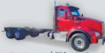
2016 T880 Kenworth | 525 Cummins, 18-speed, 225,000 miles, 20/26-air IN STOCK