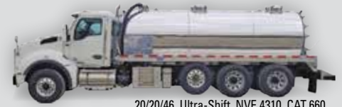
2023 Kenworth T880 | 20/20/46, Ultra-Shift, NVE 4310, CAT 660 jetter package, LED lights, LED strobes, 4-camera package, NAV system, alum. tank CALL FOR PRICING