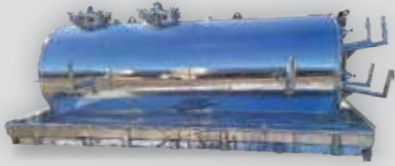
NEW Tank | 2000 (500/1500) dual vacuum tank built for grease trap and waste fryer oil collection 120" CA required. CALL FOR PRICING