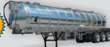
7000 - 9000 Gal. Aluminum | Air ride suspension (tri-axle), pump platform, bright finish, LED lights, Betts valves. Tri-Axle Trailers