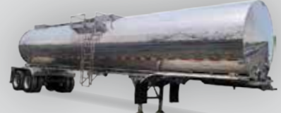
2018 9000 Gallon | 93,000 GVWR transport (aluminum tank insulated stainless steel wrapped) 6" discharge Tandem Trailer