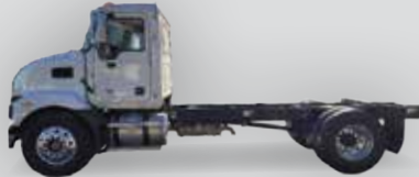
2023 Mack MD | Non-CDL, Allison Auto CALL FOR PRICING