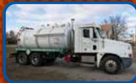
(0480C) 2001 Freightliner C-120 cab & chassis with a 2006 Presvac 3,200 U.S. gallon, C/S, dump type unit with a Presvac PV750 pump.