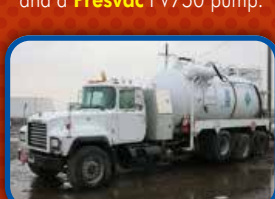
(0514C) Pre-owned 2000 Mack RD686S cab and chassis with a 4,000 U.S. gallon, carbon steel, D.O.T. certified, vacuum tank unit.