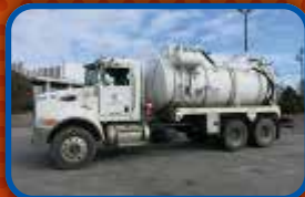
(9277C) 2013 Peterbilt 348 cab & chassis with a Presvac 3,200 U.S. gal., C/S, D.O.T. 412, dump type, vacuum tank and a Presvac PV750 pump.