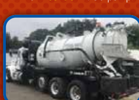
(6648V) Pre-owned Cusco Turbo Vac 3627 High Lift. Carbon steel, D.O.T. Certified with 3,600 CFM blower mounted on 2014 Peterbilt 367