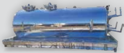
NEW Tank | 2000 (500/1500) dual vacuum tank built for grease trap and waste fryer oil collection 120" CA required. CALL FOR PRICING