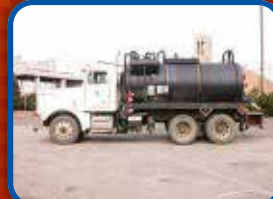
(6625C) 1997 Peterbilt 378 cab & chassis with a Presvac 3,000 U.S. gallon, carbon steel, vacuum tank & Masport HXL15WV water cooled pump.