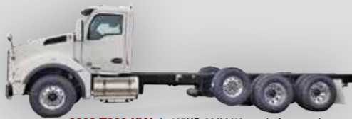
2023 T880 KW | 485HP, 20/20/46 ready for a tank Ultra-Shift | (4) in stock