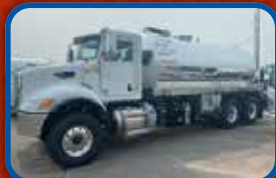
(14007) New 4,000 U.S. gallon, aluminum, vacuum tank. Mounted on a 2022 Peterbilt 348 cab and chassis with a NVE Challenger 887 vacuum pressure pump package.