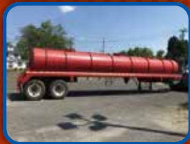
(2173C) 2007 Dragon 5460 carbon steel vacuum tank trailer.