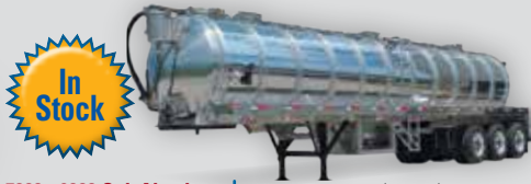
7000 - 9000 Gal. Aluminum | Air ride suspension (tri-axle), pump platform, bright finish, LED lights, Betts valves. Tri-Axle Trailers