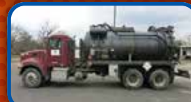
(8412C) 2009 Peterbilt 340 cab & chassis with a Presvac 3,200 U.S. gallon, C/S, D.O.T. 412, dump type, Vacuum tank and a Presvac PV750 pump.