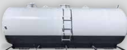
NEW Tank | 4,620 carbon steel tank w/aluminum hose trays-175"-180" CT IN STOCK