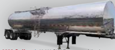
2018 9000 Gallon | 93,000 GVWR transport (aluminum tank insulated stainless steel wrapped) 6" discharge Tandem Trailer