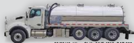
2023 Kenworth T880 | 20/20/46, Ultra-Shift, NVE 4310, CAT 660 jetter package, LED lights, LED strobes, 4-camera package, NAV system, alum. tank CALL FOR PRICING