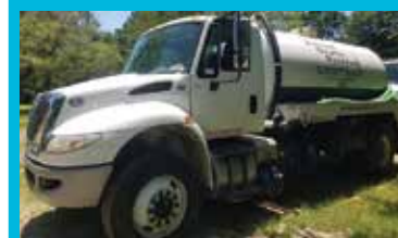
2016 International 4400 SBA 4x2. Engine: Navistar 9 9.3L6. Single axle with electronic locker. 6-speed manual transmission with PTO. Air ride cab. Bench passenger seat. 2,300-gallon tank made by Lely tank corp. (2016). Tank is in excellent shape, minor paint scratches on outside. Top manhole-20" rear-25". Tank has two rear suction valves and a front driver-side suction valve. Valves are all 4". Fruitland pump package RCF500 package. Two toolboxes on either side of truck mounted under hose trays. Pintel hitch with electronic trailer brake controller 100% functional. Mileage: 110,000 mi. Seller: Island Septic Systems. 843-559-3491. IslandsepticSystems@yahoo.com, $64,999.00 SC (P03)

LIST YOUR TRUCKS AND EQUIPMENT FOR SALE IN PUMPER CLASSIFIEDS! www.pumper.com/classifieds/place_ad