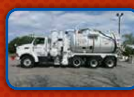
(6855C) POWERVAC 3800 3,600 U.S. gallon, carbon steel Vacuum tanker with a Hibon PD blower 3800 SCFM with vacuum to 28" mercury. High dump type; D.O.T. 407/412 regulations