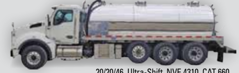
2021 Kenworth T880 | 20/20/46, Ultra-Shift, NVE 4310, CAT 660 jetter package, LED lights, LED strobes, 4-camera package, NAV system, alum. tank CALL FOR PRICING