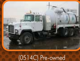
(0514C) Pre-owned 2000 Mack RD686S cab and chassis with a 4,000 U.S. gal., carbon steel, D.O.T. certified, vacuum tank unit.