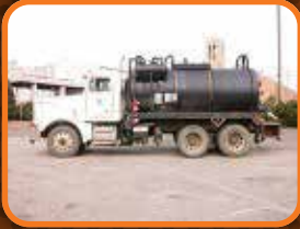
(6625C) 1997 Peterbilt 378 cab & chassis with a Presvac 3,000 U.S. gallon, C/S, vacuum tank & Masport HXL15WV water cooled pump.