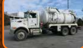
(9277C) 2013 Peterbilt 348 cab & chassis with a Presvac 3,200 U.S. gal., C/S, D.O.T. 412, dump type, vacuum tank and a Presvac PV750 pump.