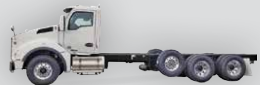
2020 T880 KW Ultra-Shift | 485HP, 20/20/46 ready for a tank (4) in stock