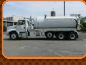
(7896C) 2001 Freightliner cab & chassis with a Keith Huber 4,000 gallon c/s full open rear door dump unit.