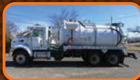
(0200V) 2011 Peterbilt 348 cab & chassis with a Presvac 3,200 U.S. gallon, C/S, D.O.T. 412, dump type, Vacuum tank and a Presvac PV750 pump.