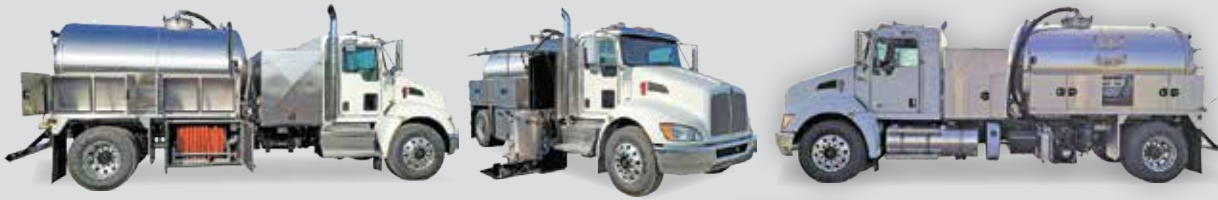
2021 T370 Kenworth GREASE TRUCK

300HP, Allison Auto, 33,000 G.V.W.R) 1800 gallon stainless steel (ITI) tank, NVE 607 ProMax package, heat collars (heat through tank), heated cabinet for ProVac unit w/hydraulic lift, Hannay hose reel w/100' 2" hose in heated cabinet.