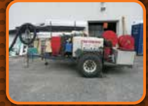
(200SC) 1999 Harben 4016-300 , high pressure sewer jet trailer mounted