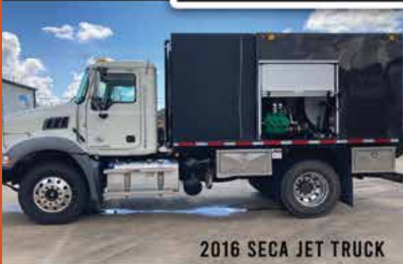
2016 SECA JET TRUCK