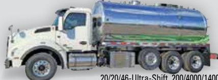
2021 Kenworth T880 | 20/20/46-Ultra-Shift, 200/4000/1400 aluminum decant tank, NVE 4310 blower package, strobes, cameras CALL FOR PRICING