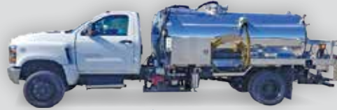
2020 Chevy 5500 | 4 x 4, diesel 1500 RVT, NVE 304 engine package. CALL FOR PRICING

300HP, Allison Auto, 33,000 G.V.W.R) 1800 gallon stainless steel (ITI) tank, NVE 607 ProMax package, heat collars (heat through tank), heated cabinet for ProVac unit w/hydraulic lift, Hannay hose reel w/100' 2" hose in heated cabinet.