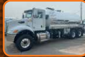
(13969) New 4,000 U.S. gallon, aluminum, vacuum tank. Mounted on a 2022 Peterbilt 348 cab and chassis w/ a NVE Challenger 887 vacuum pressure pump package.