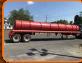
(2173C) 2007 Dragon 5460 carbon steel vacuum tank trailer.