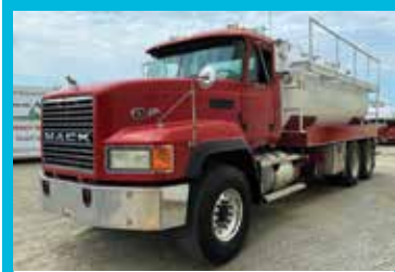
Selling a 2002 Mack CL713 Vacuum Truck with tandem axle. Vacuum pump- Demag/Wittig RFL-100. 4,300 gallon aluminum tank. 4" valve and 6" discharge valve. See Level Annihilator Tank Gauge. Asking $45,000. Please call 724-568-3623 if interested. PA (P10)