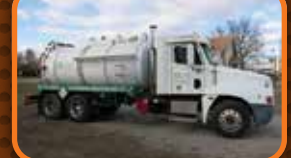
(0480C) 2001 Freightliner C-120 cab & chassis with a 2006 Presvac 3,200 U.S. gal., C/S, dump type unit with a Presvac PV750 pump.

2009 Peterbilt 340 cab & chassis with a Presvac 3,200 U.S. gallon, C/S, D.O.T. 412, dump type, vacuum tank and a Presvac PV750 pump. (Stock #8412C). www.vacuumsalesinc.com (888)VAC-UNIT (822-8648). (PBM)