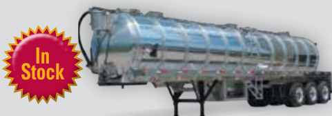
7000 - 9000 Gal. Aluminum Tri-Axle Trailers | Air ride suspension (tri-axle), pump platform, bright finish, LED lights, Betts valves.