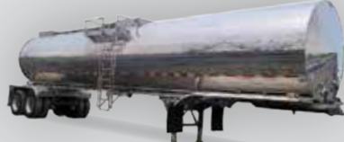
2018 9000 Gallon Tandem Trailer | 93,000 GVWR transport (aluminum tank insulated stainless steel wrapped) 6" discharge