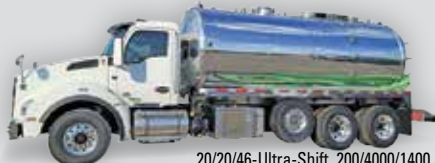
2021 Kenworth T880 CALL FOR PRICING | 20/20/46-Ultra-Shift, 200/4000/1400 aluminum decant tank, NVE 4310 blower package, strobes, cameras