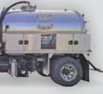
2021 T370 Kenworth GREASE TRUCK

300HP, Allison Auto, 33,000 G.V.W.R) 1800 gallon stainless steel (ITI) tank, NVE 607 ProMax package, heat collars (heat through tank), heated cabinet for ProVac unit w/hydraulic lift, Hannay hose reel w/100' 2" hose in heated cabinet.