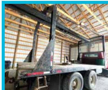
WANTED TO BUY: Used Del Zotto Hydra-Brute Unloader Bed. Call 618-918-8092. IL (P09)