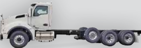
2020 T880 KW Ultra-Shift | 485HP, 20/20/46 ready for a tank (4) in stock

300HP, Allison Auto, 33,000 G.V.W.R) 1800 gallon stainless steel (ITI) tank, NVE 607 ProMax package, heat collars (heat through tank), heated cabinet for ProVac unit w/hydraulic lift, Hannay hose reel w/100' 2" hose in heated cabinet.