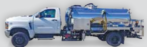
2020 Chevy 5500 CALL FOR PRICING | 4 x 4, diesel 1500 RVT, NVE 304 engine package.