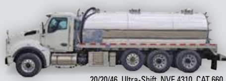
2021 Kenworth T880 CALL FOR PRICING | 20/20/46, Ultra-Shift, NVE 4310, CAT 660 jetter package, LED lights, LED strobes, 4-camera package, NAV system, alum. tank