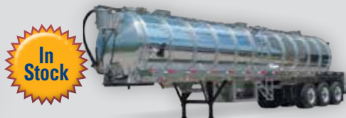
7000 - 9000 Gal. Aluminum Tri-Axle Trailers | Air ride suspension (tri-axle), pump platform, bright finish, LED lights, Betts valves.