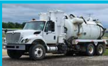
2010 International Max Force DT Workstar. Eaton Fuller 8-speed transmission. 2009 Presvac code tank with hydro hoist and rear opening door. 3,000 gallon tank. 33,429 actual miles! We bought this truck to use as a temporary truck while a new truck was being built. Do not need the truck any longer. Need the space in our yard! $58,000 obo. We got a steal of a deal on this truck - passing along to you!!

785-539-9700 or 785-564-2723. Located in Manhattan KS. Must pick up. (P09)