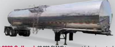
2018 9000 Gallon Tandem Trailer | 93,000 GVWR transport (aluminum tank insulated stainless steel wrapped) 6" discharge