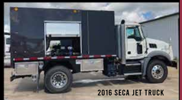
2016 SECA JET TRUCK