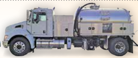
2021 T370 Kenworth GREASE TRUCK | 300HP, Allison Auto, 33,000 G.V.W.R) 1800 gallon stainless steel (ITI) tank, NVE 607 ProMax package, heat collars (heat through tank), heated cabinet for ProVac unit w/hydraulic lift, Hannay hose reel w/100' 2" hose in heated cabinet.