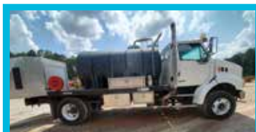
2007 Sterling Pipe Hunter Jetter truck. Municipality owned and maintained. Very clean truck with low mileage. Brand new replacement jet and camera line. Must See!! $50,000. Call 404-732-4603. GA (P10)