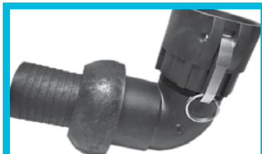
Clear the Main Line with ease, JnA Main Line Vac. Just hook the line vac to your hose, insert the incoming mainline pipe and watch the line come clean. Works on 3" & 4" pipe. Free shipping in the US. $139.99. Order at jnamainlinevac.com. 919-559-9344. (PBM)

ALUMINUM VACUUM PIPES: Parts/pipe to help you manage wastewater. Our knowledgeable staff and fast service will help you choose and quickly receive the right pipe & parts. We can custom build almost any aluminum/cast aluminum, black/galvanized steel and PVC fitting. Call 800-246-3685. Schumacher Irrigation, Inc. (P08)