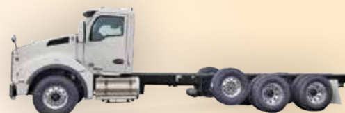
2020 T880 KW Ultra-Shift | 485HP, 20/20/46 ready for a tank (4) in stock