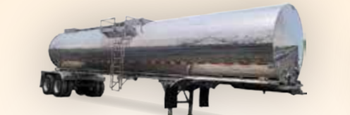
2018 9000 Gallon Tandem Trailer | 93,000 GVWR transport (aluminum tank insulated stainless steel wrapped) 6" discharge