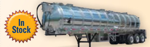
7000 - 9000 Gal. Aluminum Tri-Axle Trailers | Air ride suspension (tri-axle), pump platform, bright finish, LED lights, Betts valves.