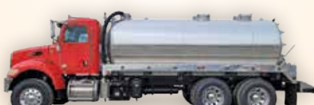
2021 Peterbilt 348 | 20/40, 3600 gallon PR aluminum tank, NVE 887 ProMax package