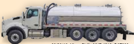
2021 Kenworth T880 | 20/20/46, Ultra-Shift, NVE 4310, CAT660 jetter package, LED lights, LED strobes, 4-camera package, NAV system, alum. tank