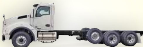
2020 T880 KW Ultra-Shift | 485HP, 20/20/46 ready for a tank (4) in stock