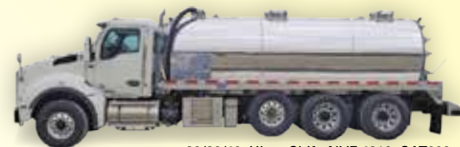
2021 Kenworth T880 | 20/20/46, Ultra-Shift, NVE 4310, CAT660 jetter package, LED lights, LED strobes, 4-camera package, NAV system, alum. tank CALL FOR PRICING