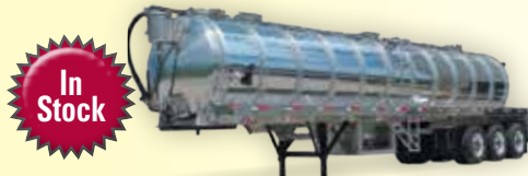
7000 - 9000 Gal. Aluminum Tri-Axle Trailers | Air ride suspension (tri-axle), pump platform, bright finish, LED lights, Betts valves.