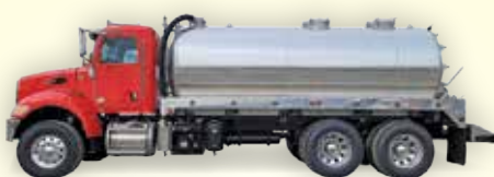
2021 Peterbilt 348 | 20/40, 3600 gallon PR aluminum tank, NVE 887 ProMax package CALL FOR PRICING