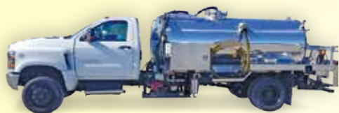
2020 Chevy 5500 | 4 x 4, diesel 1500 RVT, NVE 304 engine package. CALL FOR PRICING