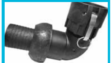
Clear the Main Line with ease, JnA Main Line Vac. Just hook the line vac to your hose, insert the incoming mainline pipe and watch the line come clean. Works on 3" & 4" pipe. Free shipping in the US. $129.99. Order at jnamainlinevac.com. 919-559-9344. (PBM)

ALUMINUM VACUUM PIPES: Parts/pipe to help you manage wastewater. Our knowledgeable staff and fast service will help you choose and quickly receive the right pipe & parts. We can custom build almost any aluminum/cast aluminum, black/galvanized steel and PVC fitting. Call 800-246-3685. Schumacher Irrigation, Inc. (P08)