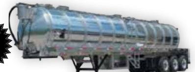
7000 - 9000 Gal. Aluminum Tri-Axle Trailers

Air ride suspension (tri-axle), pump platform, bright finish, LED lights, Betts valves.