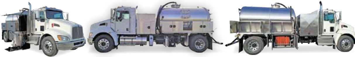
2021 T370 Kenworth TRUCK

300HP, Allison Auto, 33,000 G.V.W.R) 1800 Gallon stainless steel (ITI) tank, NVE 607 ProMax package, heat collars (heat through tank), heated cabinet for ProVac unit w/hydraulic lift, Hannay hose reel w/100' 2" hose in heated cabinet.