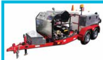
The HotJet II® is a best-selling hot- and cold-water drainline cleaner featuring a 35hp Vanguard engine by Toyota and delivering 10gpm @ 4,000psi that cleans drains up to 300' and 12" in diameter. Priced at $32,995 including freight to the lower 48 states, the HotJet II® is American made using nonproprietary parts for affordability and ease in serviceability making its return on investment truly impressive. Financing available. 800-624-8186; sales@hotjetusa.com; www.hotjetusa.com (PBM)