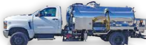
2020 Chevy 5500 CALL FOR PRICING

20/20/46, Ultra-Shift, NVE 4310, CAT660 jetter package, LED lights, LED strobes, 4-camera package, NAV system, alum. tank