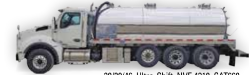
2021 Kenworth T880 CALL

300HP, Allison Auto, 33,000 G.V.W.R) 1800 Gallon stainless steel (ITI) tank, NVE 607 ProMax package, heat collars (heat through tank), heated cabinet for ProVac unit w/hydraulic lift, Hannay hose reel w/100' 2" hose in heated cabinet.