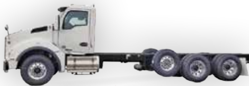
2020 T880 KW Ultra-Shift

Air ride suspension (tri-axle), pump platform, bright finish, LED lights, Betts valves.