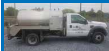
2008 Ford F550 , 4x2, 190k miles, 700/400 aluminum tank, Masport pump, new engine at 115k, new PTO in 2019, vacuum pump & tank need work. Asking $30,000. 717-278-6411, PA. (P09)

Texla Services Portable Toilet Service Truck Bodies – Standard turnkey package mounted on your chassis includes: painted body, lighting, right angle Jurup, DC10, water hose, valves & plumbing and PTO. 1,100/400 - $22,500; 700/300 - $19,500; 1,700/600 - $24,500. Call 936-641-3938. Check us out on Facebook! (PBM)