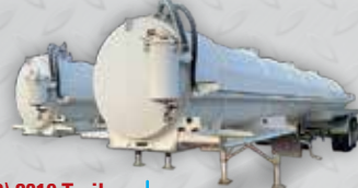
(2) 2019 Trailers CALL FOR PRICING 5500 gal. steel vacuum trailers