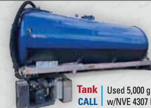
Tank Used 5,000 gal. stainless steel tank CALL w/NVE 4307 blower package