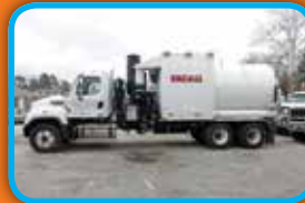
(033R) VACALL ALLVAC AVR8-18 yard debris body mounted on a 2014 Freightliner 114SD cab and chassis.