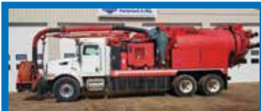
2006 Peterbilt 335, VAC-CON Sewer Jetter/Vac Combo, many new parts, Model VPD4212LHAD. Truck engine has 14,833 hours on it, original odometer replaced, current one reads 3,930. Axillary engine has 943 hours on ot. Only $109,800. Twin Star Equipment and Mfg. Phone 320-558-2800, email info@twinstartruck.com. MN (P09)