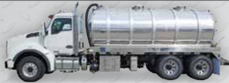
2020 Kenworth T880 5000 gal. aluminum vacuum tank, IN STOCK NVE 4310 package.