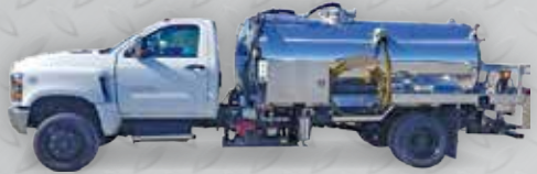
2019 Chevy 5500 4 x 4, diesel 1500 RVT, CALL FOR PRICING NVE 304 engine package.