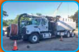
(052R) 2014 Freightliner 114 SD with a VacAll AJV1215 ; 12 yard debris body, 1500 gal. water, combination vacuum / jetting unit.