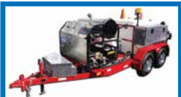
The HotJet II® is a best-selling hot-and cold-water drainline cleaner featuring a 35hp Vanguard engine by Toyota and delivering 10gpm @ 4,000psi that cleans drains up to 300' and 12" in diameter. Priced at $32,995 including freight to the lower 48 states, the HotJet II® is American made using nonproprietary parts for affordability and ease in serviceability making its return on investment truly impressive. Financing available. 800-624-8186; sales@hotjetusa.com ; www.hotjetusa.com (PBM)