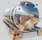
5,000 Gal. Ready to mount Aluminum tanks our chassis IN STOCK or yours.