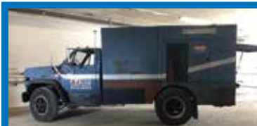
SRECO sewer cleaner. Runs/works. Acquired when purchased another company, don't need it. 1,500-gal fresh water capacity. Garage kept (no freezing issues). MAKE OFFER - Wanting to move it along. Call/txt 330-442-8070. OH (P09)