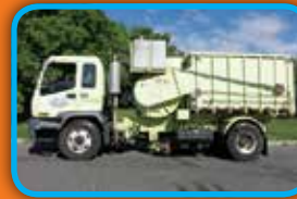
(044R) 2004 GMC T7500 dual steer cab & chassis with a VACALL LV10SC single sweep street sweeper.