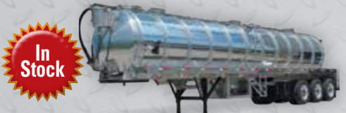
7000 - 9000 Gal. Aluminum Air ride suspension (tri-axle), pump platform, Tri-Axle Trailers bright finish, LED lights, Betts valves.