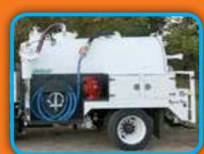
(13762V) 2018 1600 Gal. Tank New 1600 gal., potable toilet service. Tank Only.