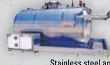
Restroom Stainless steel and Tanks aluminum available IN STOCK in various sizes and compartments.