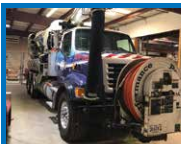
2007 Vactor 2112-PD - multi-flow, accumulator, 15" roots blower 80-2,000 PSI water pump, flat rear door. Curb side and road side, pipe fold down racks. New boom inner, extension tube and 90. Both suction hoses 8" new and plate at tank new. New cyclone separator 2019 and final filter housing. Debris tank sand-blasted and marine coated with new rear door gasket in 2019 and new decant butterfly valve. Blower serviced at dealer 2019. Well-maintained truck ready for work. Ex municipal truck out of South Carolina. Miles 173,750, total truck hours 13,102.1 as of 6/24/2020. $175,000. 757-490-7050. VA (P09)

Submit your classified ad online! www.pumper.com/classifieds/place_ad