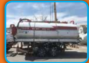
(4000V) 2006 US Tank 4,000 U.S. gal. C/S vacuum tank only.