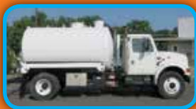
(7295C) 2001 International 4700 cab & chassis with a Transway 2,400 U.S. gal. , carbon steel, dump type vacuum tank with a Fruitland RDF500 vacuum pump.