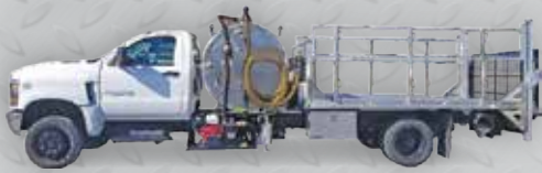
2019 Chevy 5500 4 x 4, 700 RVT, 12 unit stake body, CALL FOR PRICING NVE 304 engine package.