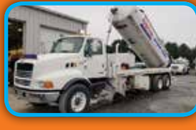
(3408V) Pre-owned Keith Huber Dominator , 4,000 U.S. gal., two compartment, dump type unit, with a Becker 440 vacuum pump package. Mounted on a 1999 Sterling cab & chassis.