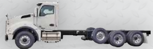
2020 T880 KW 485HP, 20/20/46 ready for a tank Ultra-Shift (4) in stock