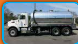
(13899) NEW 4,000 U.S. gal. , aluminum, vacuum-pressure tank mounted on a 2021 Peterbilt 348 cab & chassis with NVE Challenger 887 fan-cooled vacuum pump.