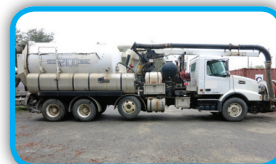
2007 Volvo VHD Vactor 2115