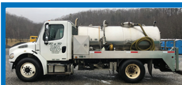
2008 Freightliner with Best stainless steel 1,000-gallon waste/500-gallon fresh water tank. .... $45,000