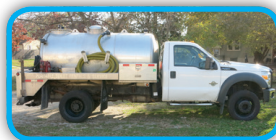
2012 Ford F550