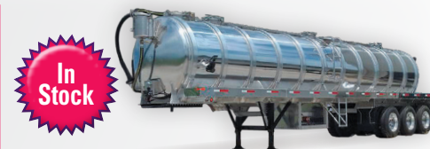
7000 - 9000 Gal. Aluminum Tri-Axle Trailers Air ride suspension (tri-axle), pump platform, bright finish, LED lights, Betts valves.