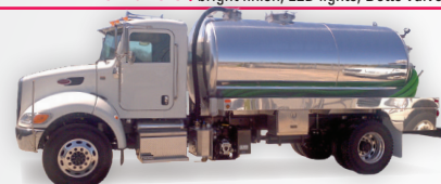
2020 Peterbilt 337 NEW 300 HP, Allison auto, NVE 607 pack, 2800 gal. aluminum tank.

NVE Pumps For Sale NEW ENGLAND DISTRIBUTOR NVE 866 and 4307 Packages Available