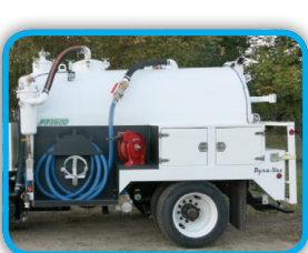
2018 1600 Gallon Tank