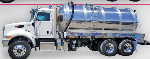
2020 Peterbilt 348 NEW 350HP, Allison auto, 4500 gal. aluminum tank, NVE 887 package