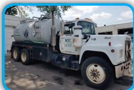
1984 Mack R686ST 1999 Keith Huber Dominator