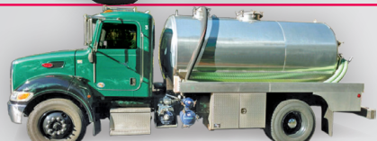
2015 Peterbilt 337 IN STOCK 300HP, auto, 2200 gal. aluminum tank, HXL400