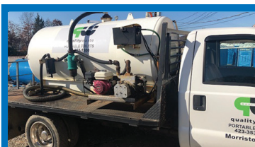
2005 Ford F350 pump truck. 5-speed with 207,752 miles. 750 waste and 250 freshwater. The truck is in operation daily and runs great. Radio and a/c work. It has a new Cummins diesel engine with approximately 52,000 miles on the engine. Asking $23,500. Call Patrick with Quality Waste: