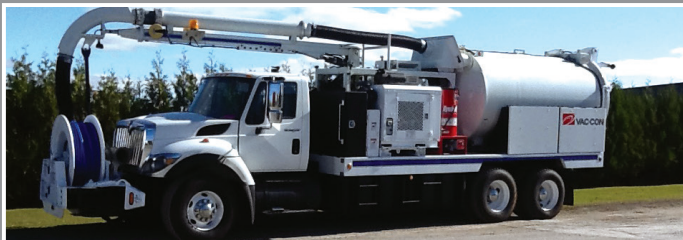
2009 Vac-Con V312LHAE