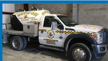
2011 F550 , 2WD, auto diesel 6.7, 140,000 miles, DEF has been deleted. 800-gallon tank total (200 freshwater/600 waste), truck is in service daily, 75% rubber, $25,000. Call or text for more information.