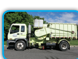
2004 GMC T7500 VACALL LV10SC