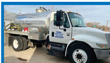
2007 International 4200 . Anthor aluminum 1,500/500 tank, dual side service. Includes built-in onboard pressure washer and DC10 washdown pump. Jurup vac/pressure pump. All new tires in 2019. Just under 73,000 miles. Pre-emissions 6.0L diesel, Allison automatic transmission, air brakes. Rear folding unit hauler. .... $54,995 OBO

Submit your classified ad online! www.pumper.com/classifieds/place_ad