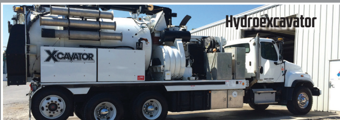
2013 Vac-Con LX312MHE/1300