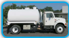
2001 International 4700 Transway