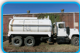
1983 Mack R686ST Presvac