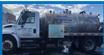
2006 International 4300 , DT466, aluminum tank - 1,400-gallon waste, 400-gallon fresh, folding portable toilet for 2 carrier, power washdown, 296k miles, manual transmission, sold as is - $23,000 OBO. Contact Friendly John:

305-444-7681, FL manager@friendlyjohn.com P01