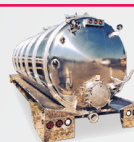
5,000 Gal. Aluminum tanks IN STOCK Ready to mount our chassis or yours.