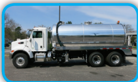
2020 Peterbilt 348