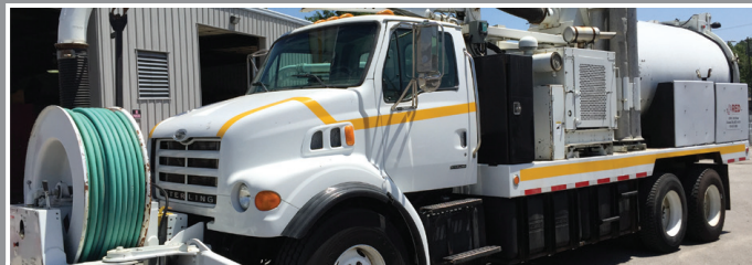
2003 Vac-Con L312LHAE/1300