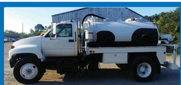
2000 Chevy , Cat motor, 1,100-gallon waste/400-gallon freshwater, Masport pump, 263,000 miles. .... $12,000

305-444-7681, FL manager@friendlyjohn.com P01