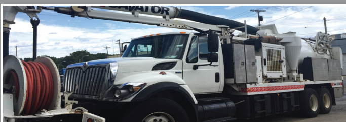
2009 Vac-Con VPD4012XLHAE