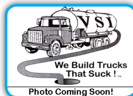
1989 Peterbilt 379