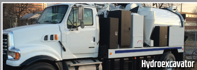
2009 Vac-Con VXP4290LH/800