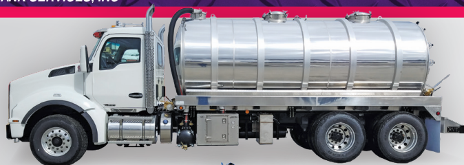
2020 Kenworth T880 IN STOCK 5000 gal. aluminum vacuum tank, NVE 4310 package.

Amanda Hensarling Baytown, TX amanda@tankservicesinc.com Cell: 401-339-9992