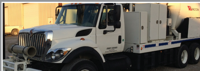
2008 Vac-Con VX312LHE/1100