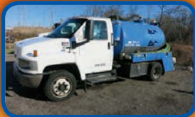
(1364V) 2004 GMC with Progress 1200 gallon, aluminum vacuum Tank and Masport pump.