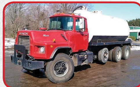
1995 Mack DM690S 5000 Gal. Tri Axle Septic Truck $30,000

Cummins ISC @ 260 hp., 6 spd., spring susp., 12k/21k axles, power divider, AC, cruise, 81K showing on unit, Imperial 2,500 gal. tank, National pres/vac pump, small pressure wash system on unit, 6" unloader with valve heaters, dual shut off manual/air knife valve, 4" pickup, 20" manway, 22.5 rubber on alum., electric windows and doors