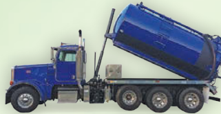
Peterbilt 4500 gallon stainless, hoist tank