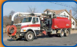
(3876C) Pre-owned 2002 Sterling LT 9500 cab and chassis with a Clean Earth Safe Jet Vac 1015 Combo Unit.