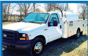
2006 Ford F350: 1,200 gallons, Jurup pump. One owner. $36,000. Also have several other trucks for sale from 1,000-6,500 gallons.