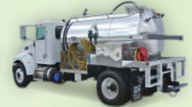
International 950 gallon stainless, carrier rack