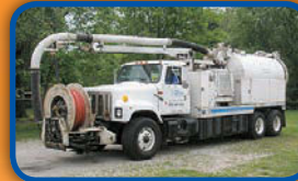
(3918C) VacCon industrial machine mounted on a pre-owned 1999 International cab and chassis