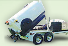
Self Contained Unit 600 gallon steel tank, 33.5 HP Kubota diesel engine (choice of pumps), 200 gallon poly tank, 6 gpm 3,000 psi jetter.