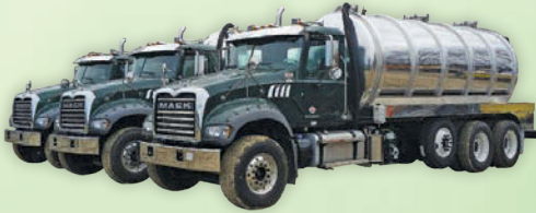
2016 MACK GRANITES AVAILABLE