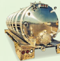
(2) 5,000 gallon aluminum tanks IN STOCK ready to mount out chassis or ours.