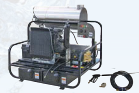
DIESEL HOT WATER