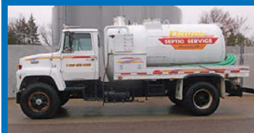
1989 Ford L8000: 215 F Ford engine, Allison automatic MT653, 2,500 steel tank, tool boxes, Fruitland 360cfm pump. 175,360 miles, CD player, trailer hitch, electric brake controller. Spare pump included with sale. Call and ask for Tim H. for more info.