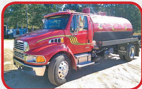
2009 Sterling Aceterra Port A John Vacuum Truck $75,900

Cummins 8.3 @ 300 hp., 8LL trans., Hendrickson spring/beam susp., power divider, Keith Huber King Vac, SHI 3,700 CFM liquid ring pump New in 2012, 3,000 gal., 20" top manway, full opening/dumping tank, 6" discharge valve, high pressure jetter system, fresh water compartment in spoils tank, 48 hours showing on jetter, aux. pres/vac pump, rollover protection, Hazardous tank, 22.5 rubber, 16,500 front/46k rear