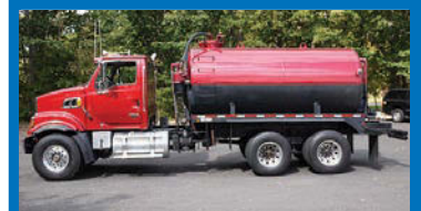
2008 Sterling LT9500: Mercedes 6-cylinder (450hp). Fuller 8LL. Aluminum wheels, A/C, power locks & windows, 66k GVW. Dickirson Septic Truck, 3,000 gallon, steel tank. Masport PTO-drive pump. 149,278 miles. Stock# 8405 .... $79,500

dustin@preventativesepctic.com Dustin 978-473-4510, MA PBM