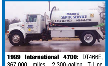
1999 International 4700: DT466E, 367,000 miles, 2,300-gallon T-Line tank, 2 tool boxes, 3" inlet, 4" outlet, Battioni pump, new transmission 2,000 miles ago. Truck is still in service daily. .... $30,000

866-720-4999 www.tankservicesinc.com P06