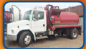
(4427V) Pre-Owned 2002 Freightliner FL70 cab and chassis with a 2,300 U.S. Gallon carbon steel vacuum tank. Complete with a Moro Vacuum pump package.