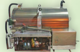
Slide-In Units 500-1,000 gallons, 1 or 2 compartment; select a pump package & engine HP. Standard units "Always in Stock" all light weight aluminum, many available options.