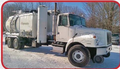
1999 Volvo WG64 Super Sucker with Railroad Gear $75,500

Check out our ENTIRE INVENTORY on our website ThreeLakesTruck.com