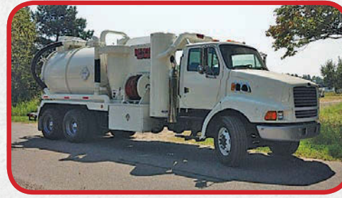
1998 Ford with Keith Huber King Vac Hazardous Unit $92,500

Cat 3306C @ 300 hp., Hendrickson susp., 20k/40k axles, Allison HD4060 5 spd. auto, power divider, 6.50 ratio, Super sucker body SN:98471297, 22.5 rubber, pulse bag, vibrator, 1/2 opening dumping body, rail road gear and pop offs, Challenger pres/vac pump, air ride cab, 234" WB, 4:11 ratio, alum. rims, California truck exceptional frame!!!