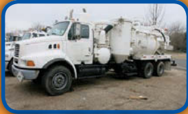
(3378V) 1999 Sterling with a 3,200 gallon Cusco MasterVac high dump unit.