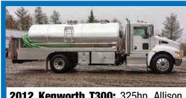
2012 Kenworth T300: 325hp, Allison RDS3000 auto., 12k,21k, 3,000-gallon (200/2,800) aluminum tank, NVE 607 "Max", complete jetter package. Call for pricing.

866-720-4999 www.tankservicesinc.com P06