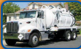
(13887A-E) 2015 Peterbilt 348, cab and chassis with a New 3,200 U.S. gal., carbon steel, D.O.T. certified 407/412 vacuum tank; dump type with full open rear door and a Presvac PVB 750 vacuum-pressure pump.