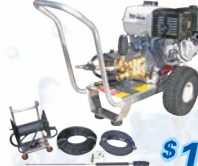
HONDA 4200 PSI JETTER