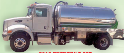
2016 PETERBILT 337 300HP, Allison auto, NVE 607 Pak, 2800 gal. alum tank. IN STOCK