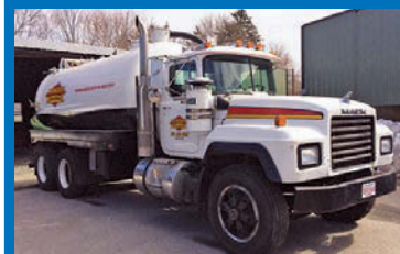
1998 Mack RD688s: Transway 4,000-gallon carbon steel tank, rear-opening door, 3 baffles, 4 sight glasses, 4" intake, 6" discharge, heated valves. Mack 12-speed extended range splitter, 350hp Mack engine, 2-stage Jake brake, differential lock. Air-ride cab, spring suspension, double frame. 170,000 miles, 13,525 hours. Transway 1,045cfm pump. Tank dumps just like a dump truck with hydraulic piston. All maintenance done. Springs front and rear, rear frog legs, kingpins, sandblasted chassis and tank, primed and painted 5 years ago. Cab in great shape - no rust. Truck is 100%. Have all paperwork since 1998. We are getting a new truck. Asking $86,000. Truck was $198,000 new. Located in Boston, MA. Call or email for more info.

dustin@preventativesepctic.com Dustin 978-473-4510, MA PBM