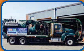
(8593C) VacCon industrial machine mounted on a pre owned 2006 Sterling cab and chassis "Work Ready"