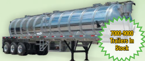
8000 & 9000 Gallon Aluminum Tri-Axle Trailers. Air ride suspension (tri-axle), pump platform, bright finish, LED lights, Betts valves, IN STOCK