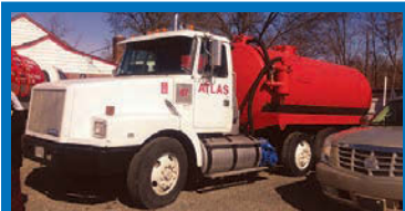
1994 GMC/WHITE Septic Pump Truck: R260 pump, 4,000-gallon Lely waste unit. Excellent condition! Mechanically sound. DOT inspected. More pictures on request! ..... $29,000