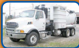
(018R) 2008 Sterling with a Guzzler Wet/Dry Industrial Vacuum Loader; 18 yard debris body, Dump type, Carbon Steel vacuum tank.