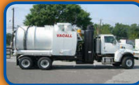
(014R) VACALL ALLVAC AVR8- 18 yard debris body mounted on a 2009 Sterling LT9500 cab and chassis