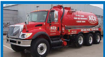
2006 International 7400: 3,600 waste/300 fresh, Transway System, Series 500 pump (396cfm), International DT 570, 310hp Fuller 10-speed. Excellent condition. ..... $79,000

866-720-4999 www.tankservicesinc.com PBM