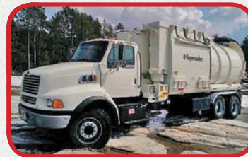
1998 Ford Louisville with Super Sucker Vac Unit $74,500

Cummins ISC @ 260 hp., 6 spd., spring susp., 12k/21k axles, power divider, ac, cruise, 81K showing on unit, Imperial 2,500 gal. tank, National pres/vac pump, small pressure wash system on unit, 6" unloader with valve heaters, dual shut off manual/air knife valve, 4" pickup, 20" man way, 22.5 rubber on alum., electric windows and doors