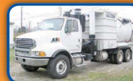
(018R) 2008 Sterling with a Guzzler Wet/Dry Industrial Vacuum Loader ; 18 yard debris body, Dump type, Carbon Steel vacuum tank.