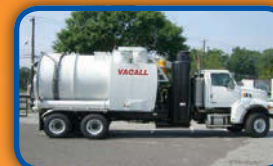
(014R) VACALL ALLVAC AVR-B- 18 yard debris body mounted on a 2009 Sterling LT9500 cab and chassis