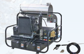
DIESEL HOT WATER