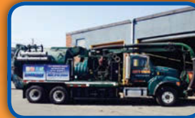
(8593C) VacCon industrial machine mounted on a pre owned 2006 Sterling cab and chassis "Work Ready"