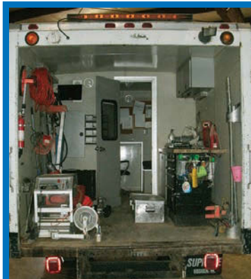
EnviroSight Supervision inspection van, 3 yrs. old, 140 crawler, SVA 350 reel w/ approx. 1,100' cable, PTZ camera, POSM software. 2002 Ford E450 van, 6,500-watt generator. .... $72,000 OBO