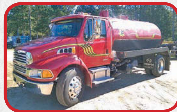
2009 Sterling Aceterra Port A John Vacuum Truck $79,500

EM7 @ 300 hp., MaxiTorque 7 spd., Mack camel back susp., 20k/40k with a 13k air up/down pusher, 4" air valve, National pres/vac pump, 22.5 rubber, dbl. frame