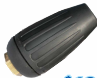
UP TO 20 GPM