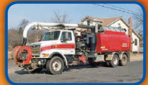
(3876C) Pre-owned 2002 Sterling LT 9500 cab and chassis with a Clean Earth Safe JetVac 1015 Combo Unit.