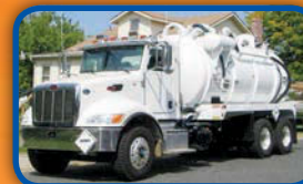
(13887A-E) 2015 Peterbilt 348, cab and chassis with a New 3,200 U.S. gal., carbon steel, D.O.T. certified 407/412 vacuum tank ; dump type with full open rear door and a Presvac PVB 750 vacuum-pressure pump.