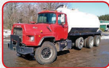
1995 Mack DM690S 5000 Gal. Tri Axle Septic Truck $33,500

Check out our ENTIRE INVENTORY on our website ThreeLakesTruck.com