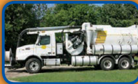
(3483C) 2006 Volvo Cab & Chassis with a Vactor 2110 combination Vacuum Loader and High Pressure sewer cleaning system. "Work Ready"