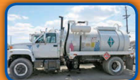
(6615V) Presvac 2,300 U.S. gallon, Carbon Steel with a Masport H15W vacuum pump installed on a 1993 GMC Kodiak cab and chassis.