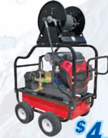
5000 PSI & REEL