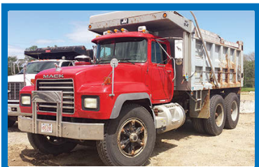
2003 RD Mack: 500hp, 8LL, 20F/58R, 100,000 miles, J&J steel body. Call for pricing.

1998 Ford L9000 with 4,000-gallon carbon steel 2-compartment waste oil tank, Blackmer pump with strainer, ReCon Cummins engine with Fuller transmission on air-ride suspension. $18,500. KLM Companies 617-909-9044 (PBM)