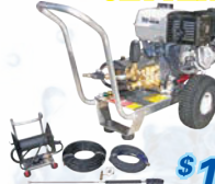
HONDA 4200 PSI JETTER