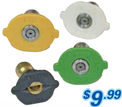
QC 4 PACK