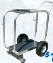
ROLL CAGE FRAMES