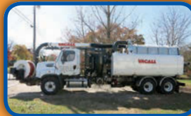
(027R) 2014 Freightliner 108 SD with a VacAll AJV1215 ; 12 yard debris body, 1500 gallons water, Combination vacuum / jetting unit.