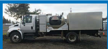
2004 International 4300: DT466, Allison auto, air brakes, 217,000 miles, 600/270. Needs freshwater pump. Four units on the deck. Liftgate has lights in it. .... $22,000