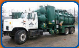
(2433V) 2002 Navistar International cab and chassis with a Powervac 5300 , 16 cubic yard, 3,250 U.S. gallons, Carbon Steel, vacuum tanker w/ Hibon PD blower.