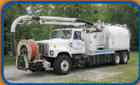
(3918C) VacCon industrial machine mounted on a pre-owned 1999 International cab and chassis