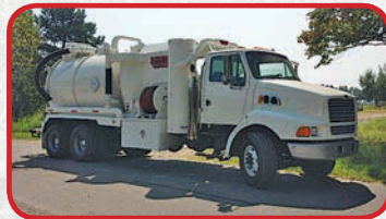
1998 Ford with Keith Huber King Vac Hazardous Unit

Cat C-13, 8LL, Hendrickson spring/beam susp., 14,600K/46k, full lockers, jake, ac, cruise, National vac pump, 24" manway, Central Star 3,200 gal. single barrel tank, block heater