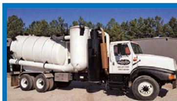
1999 International Guzzler Ace High-Dump with NEW (less than 100 hrs.) Roots 27" blower. Fresh paint, 161,517 miles. 305hp CAT C-10. Great truck - Ready to work! ....$99,500 903-738-2917, TX P01