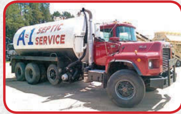
1995 Mack DM690S 5000 Gal. Tri Axle Septic Truck

Check out our ENTIRE INVENTORY on our website ThreeLakesTruck.com