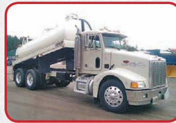
2004 Peterbilt 385 3,500 Gallon Vac Truck

Mack E-7 @ 400 hp., 9 spd., air ride, jake, cruise, ac, susp. dump, power divider, heated mirrors, elec. windows and doors, hub piloted steel rims, 22.5 tires 2001 Marsh Dot 407-412 coded tank, pop off, grounding cable, air controls to rear, 20" manway, catwalk, 12K/38k axles