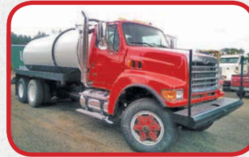
2007 Sterling Single Barrel 3,200 Gal. Vacuum Truck

Cummins ISC @ 260 hp., 6 spd., spring susp., 12k/21k axles, power divider, ac, cruise, 81K showing on unit, Imperial 2,500 gal. tank, National pres/vac pump, small pressure wash system on unit, 6" unloader with valve heaters, dual shut off manual/air knife valve, 4" pickup, 20" man way, 22.5 rubber on alum., electric windows and doors