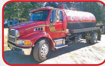
2009 Sterling Aceterra Port A John Vacuum Truck

EM7 @ 300 hp., MaxiTorque 7 spd., Mack camel back susp., 20k/40k with a 13k air up/down pusher, 4" air valve, National pres/vac pump, 22.5 rubber, dbl. frame