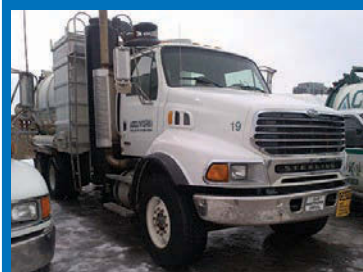
2006 Sterling LT95 Guzzler CL vacuum truck with top-loading boom, Hibon 8702 (5,300cfm blower). Excellent condition, private sale. ....Asking $135,000 416-410-7222, Ontario P11

Wanted: Air mover truck in good working condition in Missouri area. We are willing to spend up to $40,000. Guzzler, Gap or any type considered. 636-259-4400. (P11)