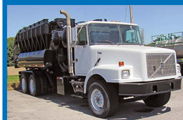
2001 Gap Vax HG57 WET/DRY on Volvo WG64, 5,500 cfm, 27" Hibon blower, Cummins engine, chassis tank and bag house, in good condition, ready for work.

1989 White Guzzler for $20,000; 1999 King Vac (needs blower) for $25,000; 1977 Vactor (rebuilt blower) for $20,000. Various other equipment at www.usienviro.com. Call 423-635-9739 (P11)