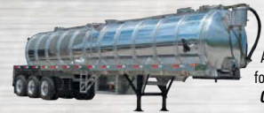
NEW 9000 Gallon Aluminum Vacuum Trailer , Air ride suspension (tri-axle), pump platform, bright finish, LED lights, Betts valves, ON THE GROUND READY FOR DELIVERY.