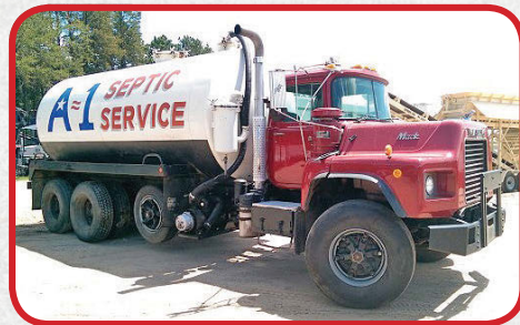
1995 Mack DM690S 5000 Gal. Tri Axle Septic Truck

Check out our ENTIRE INVENTORY on our website ThreeLakesTruck.com