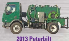
2013 Peterbilt 26,000 GVWR, auto transmission, 400/1100 stainless steel tank, Masport HXL4 pump, dual service-loaded.