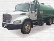
2005 M2 Freightliner , 400HP MB engine, 10-speed, 200,000 miles, Jurup 150 vacuum pump, 4200 steel tank heat on valves $46,500 OBO.