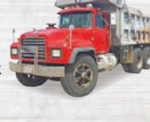
2003 RD Mack , 500HP, 8LL, 20F/58R, 100,000 miles, J&J steel body, call for pricing.