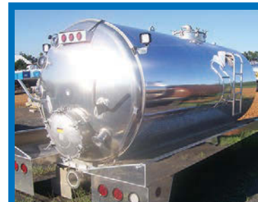
New Aluminum Tanks: 2,800-gallon $23,500; 2,500-gallon $22,500. All sizes available.