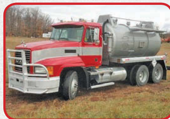
2002 Mack CH613 with Marsh 2,300 Gal. Hazmat Tank

Cummins 8.3 @ 300 hp., 8LL trans., Hendrickson spring/beam susp., power divider, Keith Huber King Vac, SIH 3,700 CFM liquid ring pump New in 2012, 3,000 gal., 20" top manway, full opening/dumping tank, 6" discharge valve, high pressure jetter system, fresh water compartment in spoils tank, 48 hours showing on jetter, aux. pres/vac pump, rollover protection, Hazardous tank, 22.5 rubber, 16,500 front/46k rear