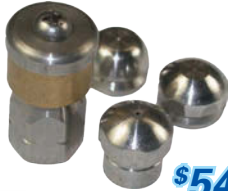
SEWER 4 PACK