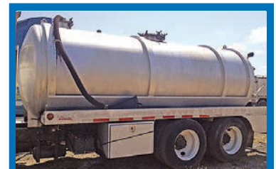
Progress aluminum vacuum tank: 3,600 gallons, $21,000. Savings of $12,500 off new. Also available: Demag RFW150, Jurup R260 vacuum pumps.