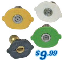
QC 4 PACK