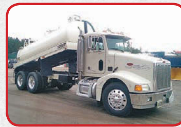
2004 Peterbilt 385 3,500 Gallon Vac Truck

Mack E-7 @ 400 hp., 9 spd., air ride, jake, cruise, ac, susp. dump, power divider, heated mirrors, elec. windows and doors, hub piloted steel rims, 22.5 tires 2001 Marsh Dot 407-412 coded tank, pop off, grounding cable, air controls to rear, 20" manway, catwalk, 12k/38k axles