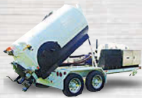
Self Contained Unit 600 gallon steel tank, 33.5 HP Kubota diesel engine (choice of pumps), 200 gallon poly tank, 6 gpm 3,000 psi jetter.