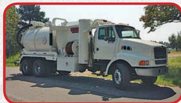
1998 Ford with Keith Huber King Vac Hazardous Unit

Cat 3306 @ 305 hp., 9 spd., dbl. frame, 16k/40k axles, Hendrickson spring/beam susp., 220" WB, 1994 Cosco 3,150 gal. full opening/dumping tank, Farid M9 hyd. driven pump, 22.5 rubber