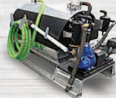
Slide-In Units 500-1,000 gallons, 1 or 2 compartment; select a pump package & engine HP. Standard units "Always in Stock" all light weight aluminum, many available options.