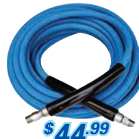
50' 4K HOSE