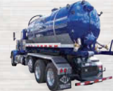
Roll Off Vacuum Tank