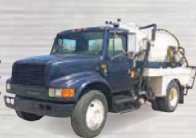
1992 International Portable Restroom Truck , 300-fresh, 1500-waste, Moro pump, gas powered jetter, portable carrier, call for pricing.