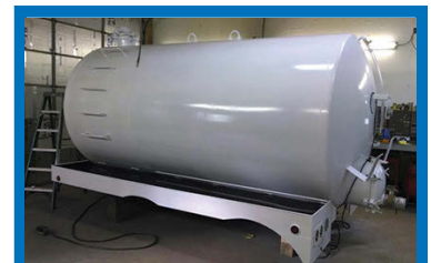
Pre-owned 3,300-gallon tank. Fresh paint. New 4" valve. Site tube. Hose trays and hangers. Primary shut off. Must go. .... $10,500

Pre-owned 3,000 U.S. gallon carbon vacuum tank unit. TANK ONLY - NO PUMP. VacuumSalesInc.com (888) VAC-UNIT (822-8648) (PBM)