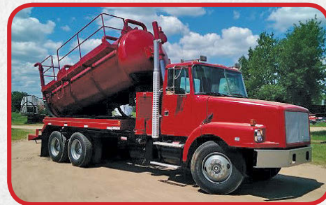
1994 White GM with Cosco 3,150 Gal. Vacuum Truck

EM7 @ 300 hp., MaxiTorque 7 spd., Mack camel back susp., 20k/40k with a 13k air up/down pusher, 4" air valve, National pres/vac pump, 22.5 rubber, dbl. frame