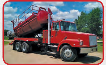
1994 White GM with Cosco 3,150 Gal. Vacuum Truck $34,500

E-7 @ 350 hp., 8LL, camel back susp., jake, 20k/46k axles, Westech hazardous full opening/dumping tank, grounding cable, New Hibon hyd. driven blower, block heater, pintle, tool boxes