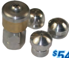
SEWER 4 PACK