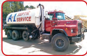
1995 Mack DM690S 5000 Gal. Tri Axle Septic Truck $38,500

EM7 @ 300 hp., MaxiTorque 7 spd., Mack camel back susp., 20k/40k with a 13k air up/down pusher, 4" air valve, National pres/vac pump, 22.5 rubber, dbl. frame