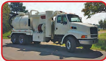
1998 Ford with Keith Huber King Vac Hazardous Unit $99,500

Cat 3306 @ 305 hp., 9 spd., dbl. frame, 16k/40k axles, Hendrickson spring/beam susp., 220" WB, 1994 Cosco 3,150 gal. full opening/dumping tank, Farid M9 hyd. driven pump, 22.5 rubber