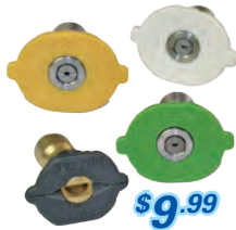
QC 4 PACK