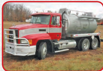
2002 Mack CH613 with Marsh 2,300 Gal. Hazmat Tank $42,500

Cummins 8.3 @ 300 hp., 8LL trans., Hendrickson spring/beam susp., power divider, Keith Huber King Vac with Kaiser 3,700 CFM liquid ring pump, 3,000 gal., 20" top manway, full opening/dumping tank, 6" discharge valve, high pressure jetter system, fresh water compartment in spoils tank, 48 hours showing on jetter, 2,251 hours showing on vac unit, aux. pres/vac pump, rollover protection, Hazardous tank, 22.5 rubber, 16,500 front/46k rear