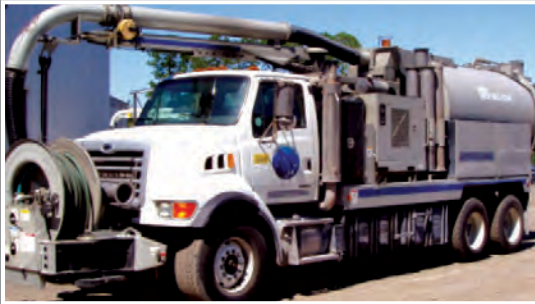
2006 VAC-CON V312LHAD