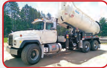
1995 Mack RD688S 4,000 Gal. Hazardous Pres Vac Truck $53,500

EM7 @ 300 hp., MaxiTorque 7 spd., Mack camel back susp., 20k/40k with a 13k air up/down pusher, 4" air valve, National pres/vac pump, 22.5 rubber, dbl. frame