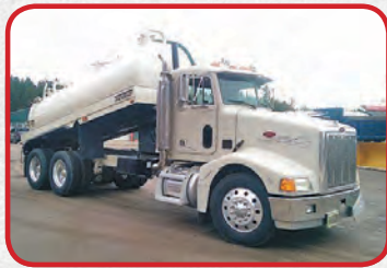
2004 Peterbilt 385 3,500 Gallon Vac Truck $82,500

Mack E-7 @ 400 hp., 9 spd., air ride, jake, cruise, ac, susp. dump, power divider, heated mirrors, elec. windows and doors, hub piloted steel rims, 22.5 tires 2001 Marsh Dot 407-412 coded tank, pop off, grounding cable, air controls to rear, 20" manway, catwalk, 12k/38k axles