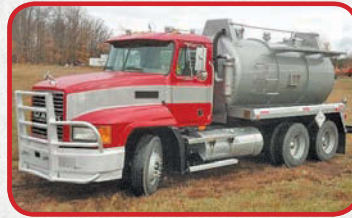
2002 Mack CH613 with Marsh 2,300 Gal. Hazmat Tank $49,500

Cummins 8.3 @ 300 hp., 8LL trans., Hendrickson spring/beam susp., power divider, Keith Huber King Vac with Kaiser 3,700 CFM liquid ring pump, 3,000 gal., 20" top manway, full opening/dumping tank, 6" discharge valve, high pressure jetter system, fresh water compartment in spoils tank, 48 hours showing on jetter, 2,251 hours showing on vac unit, aux. pres/vac pump, rollover protection, Hazardous tank, 22.5 rubber, 16,500 front/46k rear