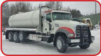
2011 Mack Granite Tri Axle 4,600 Gal. Pres Vac Truck $119,000

CMack MP-8 @ 505 hp., Mack air ride, Eaton 10 spd., 18K/20K/46K axles, super single air up/down pusher, grounding cable, Galyean 4,620 gal. steel vac tank with 20" manway and valve heaters, Juro rotary vane pres/vac pump, hose trays, ac/jake/cruise, electric windows and door locks, heated mirrors, block heater, catwalk, 5.38 ratio, 207K miles showing, 292" WB