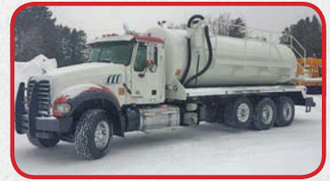
2011 Mack Granite Tri Axle 4,600 Gal. Pres Vac Truck $135,000

Mack E-7 @ 400 hp., 9 spd., air ride, jake, cruise, ac, susp. dump, power divider, heated mirrors, elec. windows and doors, hub piloted steel rims, 22.5 tires 2001 Marsh Dot 407-412 coded tank, pop off, grounding cable, air controls to rear, 20" manway, catwalk, 12k/38k axles