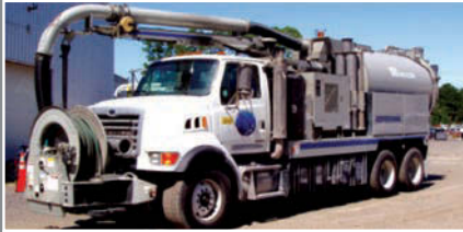
2006 VAC-CON V312LHAD