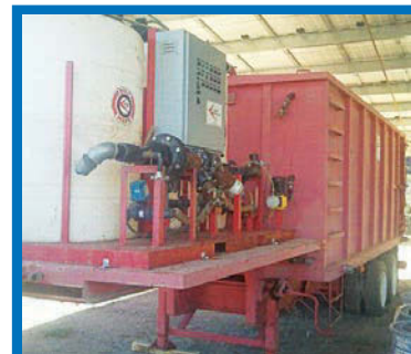
Flo Trend dewatering box mounted on a dumping trailer. 2003 Model 04-40-C WS-TM. 30-yd. box, comes with chemical feed injection system. Used less than 6 months. Perfect for onsite dewatering. Located in Phoenix, AZ ..... $29,500