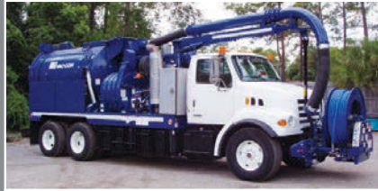
2004 VAC-CON V311LHAD