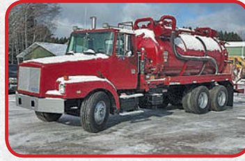
1994 White GM with Cosco 3,150 Gal. Vacuum Truck $39,500

E-7 @ 350 hp., 8LL, camel back susp., jake, 20k/46k axles, Westech hazardous full opening/dumping tank, grounding cable, New Hibon hyd. driven blower, block heater, pintle, tool boxes