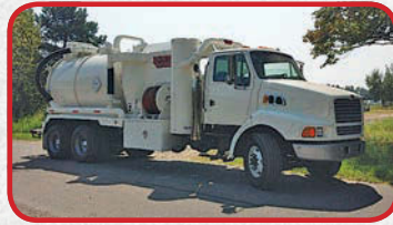
1998 Ford with Keith Huber King Vac Hazardous Unit $109,500

CMack MP-8 @ 505 hp., Mack air ride, Eaton 10 spd., 18K/20K/46K axles, super single air up/down pusher, grounding cable, Galyean 4,620 gal. steel vac tank with 20" manway and valve heaters, Juro rotary vane pres/vac pump, hose trays, ac/jake/cruise, electric windows and door locks, heated mirrors, block heater, catwalk, 5.38 ratio, 207K miles showing, 292" WB