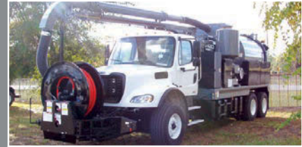
2009 VAC-CON VPD3609LHAN