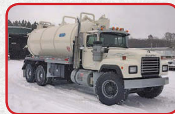
1995 Mack RD6885 4,000 Gal. Hazardous Pres Vac Truck $59,500

Mack MP-8 @ 505 hp., Mack air ride, automatic, 18K/20K/46K axles, super single air up/down pusher, grounding cable, Galyean 4,620 gal. steel vac tank with 20" manway and valve heaters, Juro rotary vane pres/vac pump, hose trays, ac/jake/cruise, electric windows and door locks, heated mirrors, block heater, catwalk, 5.38 ratio, 176K showing, 292" WB