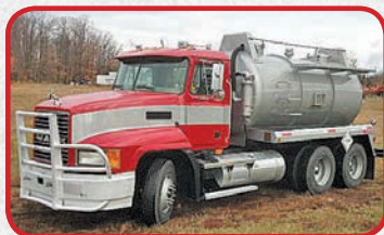
2002 Mack CH613 with Marsh 2,300 Gal. Hazmat Tank $52,500

Detroit 8V92TA @ 500 hp., Allison CLT 754.5 spd. auto., Hendrickson air ride, Rockwell 20k/22k/22k/22k axles, front and rear axle steer, jake, 2 speed transfer case, ether asst. start, 16.00R20 single tire, 68" turn radius, "NEW" Rowe 18" heated steel box, 19.33 cubic yards without side boards, 22.5 cubic yards with side boards, high lift gate, pintle hitch, air to rear