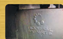
2007 Biodiesel Plant