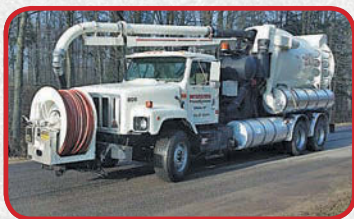
2000 International Vactor 2100 Series Combo Unit $95,500

Cummins 8.3 @ 300 hp., 8LL trans., Hendrickson spring/beam susp., power divider, Keith Huber King Vac with Kaiser 3,700 CFM liquid ring pump, 3,000 gal., 20" top manway, full opening/dumping tank, 6" discharge valve, high pressure jetter system, fresh water compartment in spoils tank, 48 hours showing on jetter, 2,251 hours showing on vac unit, aux. pres/vac pump, rollover protection, Hazardous tank, 22.5 rubber, 16,500 front/46k rear