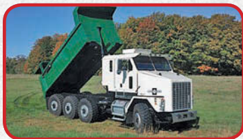
2003 Oshkosh M1070 8X8 Dump Truck $92,500

Detroit 8V92TA @ 500 hp., Allison CLT 754.5 spd. auto., Hendrickson air ride, Rockwell 20k/22k/22k/22k axles, front and rear axle steer, jake, 2 speed transfer case, ether asst. start, 16.00R20 single tire, 68" turn radius, "NEW" Rowe 18" heated steel box, 19.33 cubic yards without side boards, 22.5 cubic yards with side boards, high lift gate, pintle hitch, air to rear