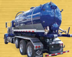
Roll Off Vacuum Tank