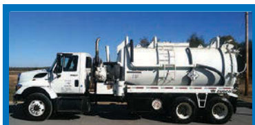
2009 International Harvester Cusco: 3,200-gallon Cusco Liq-Vac. 117,182 miles, 4,457 engine hours. 547cfm, M9 Moro pump. .... $140,000 Call 205-910-7577 AL P12

2008 Sterling with a Guzzler wet/dry industrial vacuum loader, 18-yard debris body, dump type, carbon steel vacuum tank. (Stock #2347V) www.VacuumSalesInc.com , (888) VAC-UNIT (822-8648) (PBM)