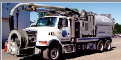
2006 VAC-CON V312LHAD