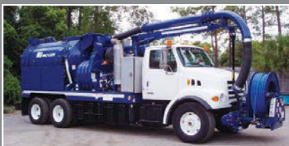
2004 VAC-CON V311LHAD