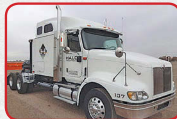
2007 International 9400I Sleeper with Vac Unit $44,500

Cat 3306 @ 305 hp., 9 spd., dbl. frame, 16k/40k axles, Hendrickson spring/beam susp., 220" WB, 1994 Cosco 3,150 gal. full opening/dumping tank, Farid M9 hyd. driven pump, 22.5 rubber