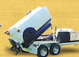
Self Contained Unit

600 gallon steel tank, 33.5 HP Kubota diesel engine (choice of pumps), 200 gallon poly tank, 6 gpm 3,000 psi jetter.