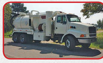
1998 Ford with Keith Huber King Vac Hazardous Unit $109,500

Detroit 60 Series @ 330 hp., 10 spd., International air ride, 12K/40K axles, power divider, cruise, AC, 2000 Keith Huber Dominator, full opening/dumping tank, DOT 412 with pop offs and grounding cable, emergency shut off, hose tray, hyd. driven Wittig pump, 22.5 on steel rims, battery monitoring system, block heater, tool box, 217" WB, 3,292 hours showing