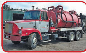
1994 White GM with Cosco 3,150 gal. Vacuum Truck $44,500

Cat dsl., automatic, Hendrickson susp., 20k/46k rating, 238" WB, AC, cruise, power divider, 4 freshwater tanks, Vactor model 2115-36, SN:00-01-7131, full opening/dumping tank, NEW Roots 824 RCS rotary blower, New water piston pump, jetter reel, remote, tele boom, dbl. frame, 22.5 rubber on steel