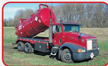
1996 International with Hazardous 3,200 Gal. Keith Huber Vac Truck $73,500

Mack E-7 @ 400 hp., 9 spd., air ride, jake, cruise, AC, susp. dump, power divider, heated mirrors, elec. windows and doors, hub piloted steel rims, 22.5 tires 2001 Marsh Dot 407-412 coded tank, pop off, grounding cable, air controls to rear, 20" manway, catwalk, 12k/38k axles