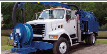
2007 VAC-CON VPD2130BH/500