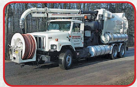
2000 International Vactor 2100 Series Combo Unit $95,500

Cummins 8.3 @ 300 hp., 8LL trans., Hendrickson spring/beam susp., power divider, Keith Huber King Vac with Kaiser 3,700 CFM liquid ring pump, 3,000 gal., 20" top manway, full opening/dumping tank, 6" discharge valve, high pressure jetter system, fresh water compartment in spoils tank, 48 hours showing on jetter, 2,251 hours showing on vac unit, aux. pres/vac pump, rollover protection, hazardous tank, 22.5 rubber, 16,500 front/46k rear