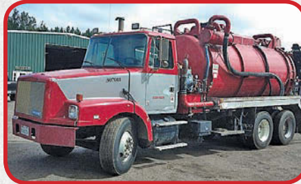
1994 White GM with Cosco 3,150 gal. Vacuum Truck $39,500

200 gal. freshwater, 500 gal. spoils, tandem, cantilever susp., 20" manway, dumping, Kohler Pro 25 gas driven, Roots blower, pintle hitch, 9.50-16.5 tires, beacon lights