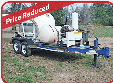
Vac Master Hydro Excavation Trailer $16,500

Cat C 13, 10 spd., front and rear air ride, jake, 244" WB, 60" sleeper, alum. front rims, Challenger 607 pres/vac unit with 4" fittings, 326K miles showing, unit has a ProHeat system on it