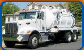
(13577 A-D) 2014 Peterbilt 348, cab and chassis with a New 3,200 U.S. gal., carbon steel, D.O.T. certified 407/412 vacuum tank; dump type with full open rear door and a Presvac PVB 750 vacuum-pressure pump.