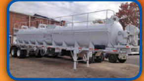
(13525V) New Presvac 5,500 U.S. gal., Carbon Steel D.O.T. certified 412 Vauum Pressure trailer with a front porch mounted PVB-750 vacuum pressure pump driven by a Deutz air cooled diesel engine.