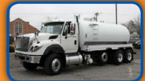
(13509 A-E) 2013 International 7600 cab and chassis 4,600 U.S. gal., carbon steel vacuum tank; and a RCF 500 vacuum-pressure pump.