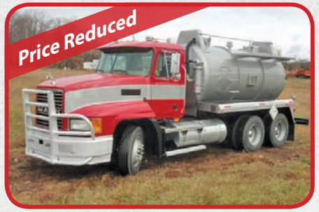
2002 Mack CH613 with Marsh 2,300 Gal. Hazmat Tank $52,500

Cat dsl., automatic, Hendrickson susp., 20k/46k rating, 238" WB, AC, cruise, power divider, 4 freshwater tanks, Vactor model 2115-36, SN:00-01-7131, full opening/dumping tank, NEW Roots 824 RCS rotary blower, jetter reel, remote, tele boom, dbl. frame, 22.5 rubber on steel