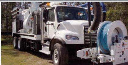
2011 VAC-CON V311LHA-O/1000