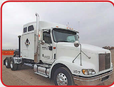
2007 International 9400I Sleeper with Vac Unit $49,500

Detroit 60 Series @ 330 hp., 10 spd., International air ride, 12K/40K axles, power divider, cruise, ac, 2000 Keith Huber Dominator, full opening/dumping tank, DOT 412 with pop offs and grounding cable, emergency shut off, hose tray, hyd. driven Wittig pump, 22.5 on steel rims, battery monitoring system, block heater, tool box, 217"WB, 3,292 hours showing