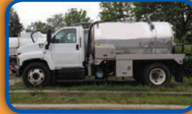
(2974C) 2007 Chevy C-7500 cab and chassis with a Presvac 2,000 U.S. gal., 2 compartment 600/1400 Aluminum vacuum tank with a Moro M-3 vacuum pump