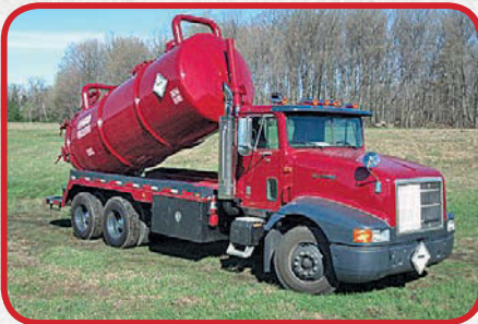
1996 International with Hazardous 3,200 Gal. Keith Huber Vac Truck $79,500

Detroit 60 Series @ 330 hp., 10 spd., International air ride, 12K/40K axles, power divider, cruise, ac, 2000 Keith Huber Dominator, full opening/dumping tank, DOT 412 with pop offs and grounding cable, emergency shut off, hose tray, hyd. driven Wittig pump, 22.5 on steel rims, battery monitoring system, block heater, tool box, 217"WB, 3,292 hours showing