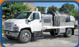
(13234V) 2006 GMCTC6500 cab & chassis truck mounted jetting unit, w/ JET EYE Camera System, 3,000 psi @ 50 gpm, 1000 gal. water, 600 ft of hose 500 cfm blower and 1/2 yard debris tank and attachments