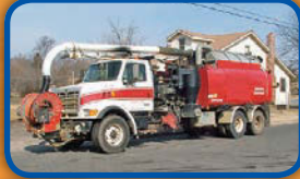
(3876C) Pre-owned 2002 Sterling LT 9500 cab and chassis with a Clean Earth Safe Jet Vac 1015 Combo Unit.