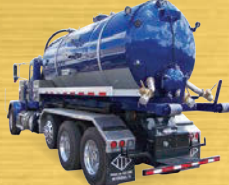
Roll Off Vacuum Tank