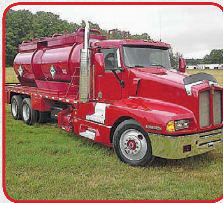
1992 Kenworth T600 Hazardous Material Vacuum Transfer Truck $49,500

Cat 3306 @ 305 hp., 9 spd., dbl. frame, 16k/40k axles, Hendrickson spring/beam susp., 220" WB, 1994 Cosco 3,150 gal. full opening/dumping tank, Farid M9 hyd. driven pump, 22.5 rubber