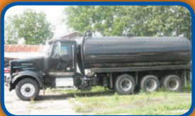
(3363V) Pre-owned Presvac 5,000 U.S. gal., Carbon Steel, vacuum-pressure tank. Mounted on 2004 Western Star cab and chassis with a Masport 20W vacuum pressure pump package