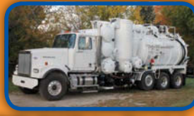
(13518V) 2013 Western Star cab & chassis POWERVAC 5300, 3,250 U.S. gal., carbon steel D.O.T. 407/412 regulations Vacuum tanker with a Hibon PD blower 5300 SCFM with vacuum to 28" mercury. Dump Type with full open rear door and a Presvac PVB 750 vacuum-pressure Pump