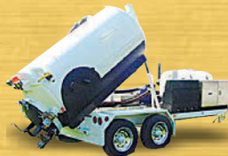
Self Contained Unit

600 gallon steel tank, 33.5 HP Kubota diesel engine (choice of pumps), 200 gallon poly tank, 6 gpm 3,000 psi jetter.