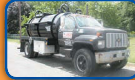
(6615V) 1993 Chevy Kodiak with a Presvac 2,300 U.S. gal., Carbon steel, D.O.T. certified, vacuum tank unit.