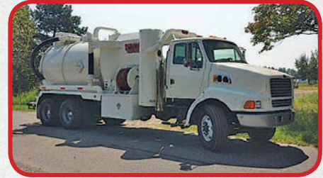
1998 Ford with Keith Huber King Vac Hazardous Unit $119,500

400 gal. freshwater, 2,300 spoils, full opening/dumping tank, hazardous 407/412 coded, SN:T03134, pop offs, air valves, last inspected 8-10