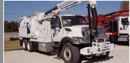
2008 VAC-CON VX312LHE/1300