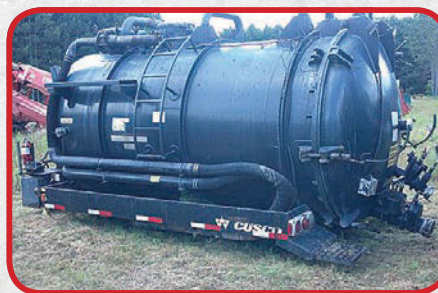
2003 Cosco 2,700 Gal. Hazardous Vacuum Tank $29,500

Cat 3406B @ 330 hp., 10 spd., diff lock, chemical circulation system, Reyco susp., dual air operated tanks w/Fluid King mechanical sealed pump, Batts Industry Coated Tanks, catwalk, roll over protection