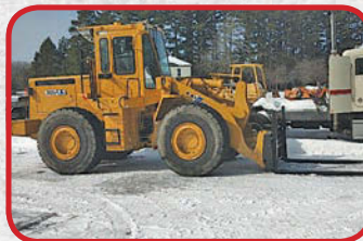
Kawasaki 70Z III Wheel Loader $34,500

Detroit 60 Series @ 400 HP, Allison HT 740 automatic trans., 18k/52k axles, Hendrickson spring/beam susp., jake, sliding 5th wheel, ether asst. system, 4.89 ratio, pintle, air to rear, wet kit, two spd. transfer case, lowboy ramps, Tulsa 45k winch with 1" cable, 33" tail roller, 22.5 rubber, beacon, 175" WB, tool box's, air driver and pass. seat