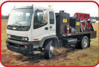
1999 Chevy T7500 Fuel/Lube Truck $16,500

Detroit 12.7 Series 60, 13 spd., air ride, 12k/40k axles, jake, cruise, diff. lock, sliding 5th wheel, alum. rims, 22.5 rubber, service records, Ali Arc push bumpers, quarter fenders, heated mirrors, 212" WB, used for tanker hauling, excellent maint. program, records for any repair of replacement parts, some have new clutch's, new motors, transmission, ect.