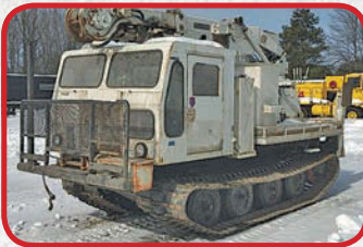
TF 60 Terra Flex Digger Derrick $39,500

33" track width, Detroit 353, AMU 2 winch, outriggers, digger derrick unit with 18" bit and bucket, aux. hyd. to rear, rubber drive sprockets, direct drive trans., heat, enclosed cab, SN:600170781D024