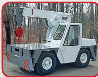
3330C Shuttlelift Carry Deck Crane $16,500

Cummins 6BTA @ 158 hp., powershift, enclosed cab with heat and air, quick tach with forks, weight of unit 28,090 lbs., SN:70C1 5131, new paint