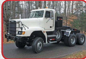
1992 Freightliner 6X6 Winch Daycab $52,500

Extendable with drop in sections, set up for 4th axle flip, non ground bearing, 102" wide, alum. rims, tri-axle, boom well, outriggers, d-rings, air ride, front flip ramps, frame support, 255/70R22.5 tires, adjustable ride height, 31' in the well