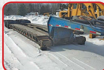
1996 Etnyre 60 Ton Lowboy Bolt in Extendable $59,500

Cat dsl., Allison automatic, spring susp., 14' Dryden lubrication bed, 5 reel dispersal with air, on road diesel/off road diesel/motor oil/hydraulic oil/ oil salvage tank, tool box's, compressor, 11R22.5 tires, 11k/22k axles, 58k showing on odometer