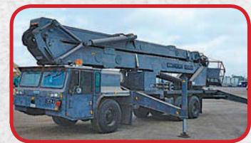
1997 Badger 6X6 with Condor 125S Manlift $89,500

11' upper, 37' main, 5' beaver with 4' flip ramps, self contained, ratchets, stake pockets, 102" wide, Palfinger PK8080 with outriggers, d-rings, spread axle, air ride, tool box, steel frame with wood floor, 70R22.5 rubber on hub piloted rims, lift cap. of Palfinger 4,012 lbs. @ 13.5', 1,609 lbs. @ 31'