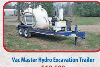
Vac Master Hydro Excavation Trailer $18,500

SCummins 400, Eaton 14615 trans., air ride, 12k/40k axles, 252" WB, lowboy ramps, live roller, Braden Winch, 22.5 rubber