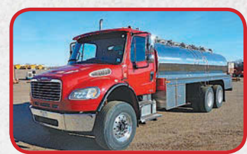
2007 Freightliner M2 106 Stainless Tanker Truck $69,500

Detroit 60 Series @ 330 hp., 10 spd., International air ride, 12K/40K axles, power divider, cruise, ac, 2000 Keith Huber Dominator, full opening/dumping tank, DOT 412 with pop offs and grounding cable, emergency shut off, hose tray, hyd. driven Wittig pump, 22.5 on steel rims, battery monitoring system, block heater, tool box, 217" WB, 3,292 hours showing