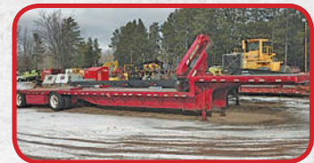
1998 Fruehauf 53 Ft. Stepdeck with Palfinger PK8080 Knuckleboom Crane $22,500

Mercedes-Benz 7.2L @ 300 hp., 8LL trans., full locker, Air Liner susp., 18k/40k axles, air ride cab, 236" WB, alum. front rims, Bluegrass 6 compartment stainless tank