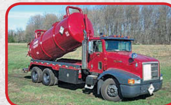
1996 International with Hazardous 3,200 Gal. Keith Huber Vac Truck $79,500

200 gal. freshwater, 500 gal. waste, tandem, cant e lever susp., 20" manway, dumping, Kohler Pro 25 gas driven, Roots blower, pintle hitch, 9.50-16.5 tires, beacon lights