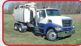
2002 Sterling with Aquatech B10 Vacuum Body $69,500

Cummins dsl., 3 spd., EROPS, heat, foot controlled forward/reverse, stabilizers, 33' reach two hyd. one manual extension, 15k cap., SN:11806-90, 1,626 hrs. showing, 12'X76" dimensions, new paint