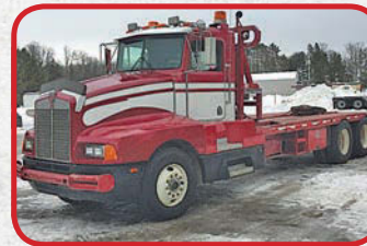
1986 Kenworth T600A Winch Tractor $28,500

Cat C-10 @ 350hp, 12k/46k axles, Hend. spring/beam susp., automatic trans., power divider, 22.5 rubber, full opening and dumping rear, FMC 3 piston pump 80 gpm/2000 psi, Roots 624 rotary lobe blower, center mount boom, pintle hitch, reel and controls on rear, 240" WB, 10 cubic yard debris body, 1000 gal. fresh-water tanks, internal flush out system, vibrator