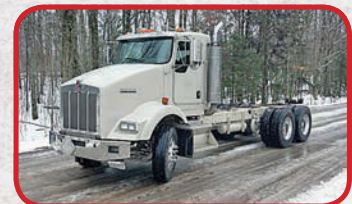
2004 Kenworth T800 Cab and Chassis $49,500

Cummins M11, Allison auto, Hendrickson susp., 21K/40K axles, 212" WB, Condor 26' body, rear mounted 119' 3 section folding boom, 4 hyd. stabilizers, 6X6, 45' 6" length, 12'3" high, 325 hrs., 1,500 miles showing