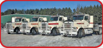
(9) 93-00 Peterbilt 357 DayCabs $29,500 each

33" track width, Detroit 353, AMU 2 winch, outriggers, digger derrick unit with 18" bit and bucket, aux. hyd. to rear, rubber drive sprockets, direct drive trans., heat, enclosed cab, SN:600170781D024