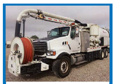
2009 Sterling Vac-Con VPD3616LHAEN S\N: 09085083. Bean jetting pump. Roots 824 RCS blower. 16-yard debris tank. ISX Cummins diesel. Push-button automatic. 54,587 miles. 66,000 GVW. Hendrickson spring.

2006 Sterling Vac-Con V390LHAD: 3-stage fan, 9-yard debris tank, Triplex pump. Cat diesel, Push-button auto. 41,000 GVW. www. khtrucks.com 972-938-1905. (C11)