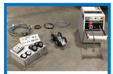
2005 Envirosight Rovver System: Camera with pan and tilt, color monitor, auto leveling. Includes TR 150 cable reel and control unit.