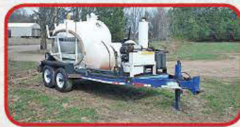
Vac Master Hydro Excavation Trailer $18,500

Cummins 6BTA @ 158 hp., powershift, enclosed cab with heat and air, quick tach with forks, weight of unit 28,090 lbs., SN:70C1 5131, new paint