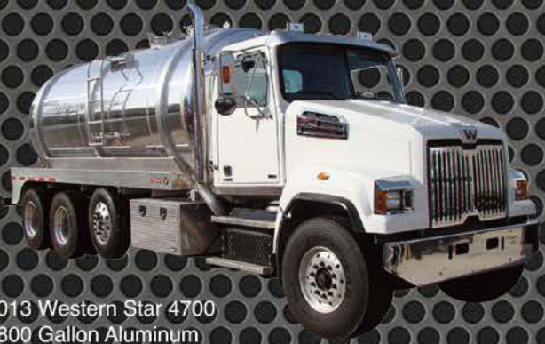
2013 Western Star 4700 4800 Gallon Aluminum