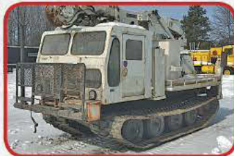
TF 60 Terra Flex Digger Derrick $39,500

33" track width, Detroit 353, AMU 2 winch, outriggers, digger derrick unit with 18" bit and bucket, aux. hyd. to rear, rubber drive sprockets, direct drive trans., heat, enclosed cab, SN:600170781D024