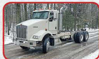
2004 Kenworth T800 Cab and Chassis $49,500

Detroit 60 Series @ 330 hp., 10 spd., International air ride, 12K/40K axles, power divider, cruise, ac, 2000 Keith Huber Dominator, full opening/dumping tank, DOT 412 with pop offs and grounding cable, emergency shut off, hose tray, hyd. driven Wittig pump, 22.5 on steel rims, battery monitoring system, block heater, tool box, 217" WB, 3,292 hours showing