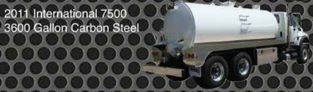
2011 International 7500 3600 Gallon Carbon Steel