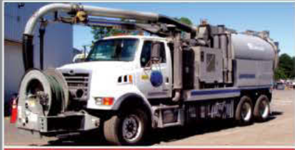
2006 VAC-CON V312LHAD