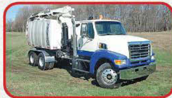
2002 Sterling with Aquatech B10 Vacuum Body $69,500

Detroit 60 Series @ 400 HP, Allison HT 740 automatic trans., 18k/52k axles, Hendrickson spring/beam susp., jake, sliding 5th wheel, ether asst. system, 4.89 ratio, pintle, air to rear, wet kit, two spd. transfer case, lowboy ramps, Tulsa 45k winch with 1" cable, 33" tail roller, 22.5 rubber, beacon, 175" WB, tool box's, air driver and pass. seat