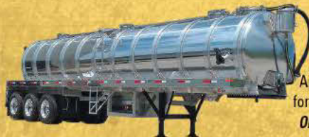
NEW 9000 Gallon Aluminum Vacuum Trailer. Air ride suspension (tri-axle), pump platform, bright finish, LED lights, Betts valves, ON THE GROUND READY FOR DELIVERY.