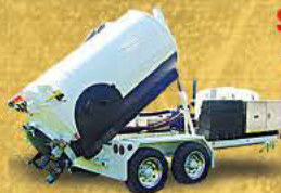
Self Contained Unit 600 gallon steel tank, 33.5 HP Kubota diesel engine (choice of pumps), 200 gallon poly tank, 6 gpm 3,000 psi jetter.