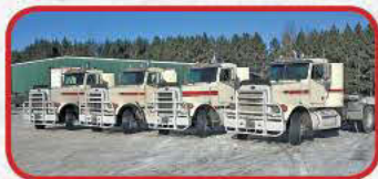
(9) 93-00 Peterbilt 357 DayCabs $29,500 each

33" track width, Detroit 353, AMU 2 winch, outriggers, digger derrick unit with 18" bit and bucket, aux. hyd. to rear, rubber drive sprockets, direct drive trans., heat, enclosed cab, SN:600170781D024