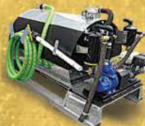
Slide-In Units 500-1,000 gallons, 1 or 2 compartment; select a pump package & engine HP. Standard units "Always in Stock" all light weight aluminum, many available options.