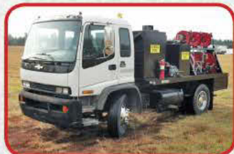
1999 Chevy T7500 Fuel/Lube Truck $16,500

11' upper, 37' main, 5' beaver with 4' flip ramps, self contained, ratchets, stake pockets, 102" wide, Palfinger PK8080 with outriggers, d-rings, spread axle, air ride, tool box, steel frame with wood floor, 70R22.5 rubber on hub piloted rims, lift cap. of Palfinger 4,012 lbs. @ 13.5', 1,609 lbs. @ 31'