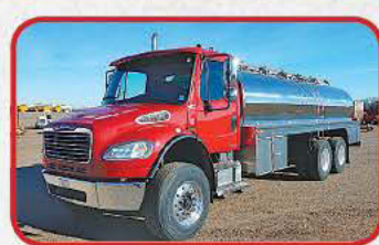
2007 Freightliner M2 106 Stainless Tanker Truck $69,500

Cat C-10 @ 350hp, 12k/46k axles, Hend. spring/beam susp., automatic trans., power divider, 22.5 rubber, full opening and dumping rear, FMC 3 piston pump 80 gpm/2000 psi, Roots 624 rotary lobe blower, center mount boom, pintle hitch, reel and controls on rear, 240" WB, 10 cubic yard debris body, 1000 gal. fresh-water tanks, internal flush out system, vibrator