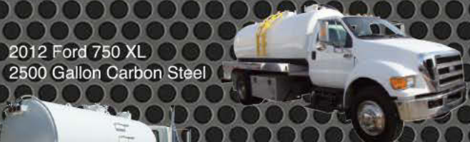
2012 Ford 750 XL 2500 Gallon Carbon Steel