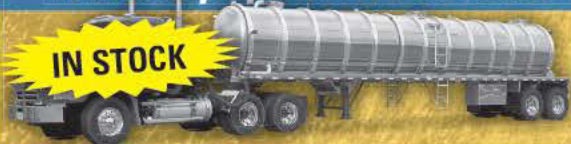
Vacuum Trailers 6000-9000 gallon aluminum

Need Equipment? Contact Us We Can Get It. 866.720.4999