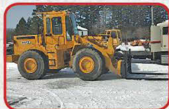
Kawasaki 70Z III Wheel Loader $34,500

Cat dsl., Allison automatic, spring susp., 14' Dryden lubrication bed, 5 reel dispersal with air, on road diesel/off road diesel/motor oil/hydraulic oil/oil salvage tank, tool box's, compressor, 11R22.5 tires, 11k/22k axles, 58k showing on odometer