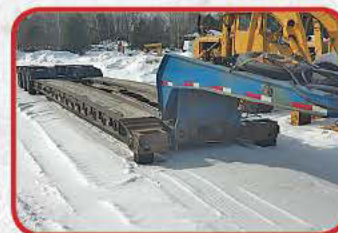
1996 Etnyre 60 Ton Lowboy Bolt in Extendable $59,500

Cummins M11, Allison auto, Hendrickson susp., 21K/40K axles, 212" WB, Condor 26' body, rear mounted 119' 3 section folding boom, 4 hyd. stabilizers, 6X6, 45' 6" length, 12'3" high, 325 hrs., 1,500 miles showing