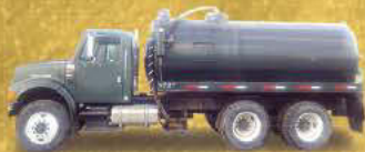
2000 International 4900 International 530E Power, 6 spd trans, 14,108 orig miles, 3500 gallon vac tank