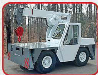
3330C Shuttletlift Carry Deck Crane $16,500

Extendable with drop in sections, set up for 4th axle flip, non ground bearing, 102" wide, alum. rims, tri-axle, boom well, outriggers, d-rings, air ride, front flip ramps, frame support, 255/70R22.5 tires, adjustable ride height, 31' in the well