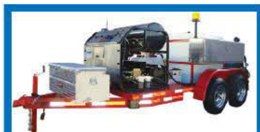
Xtreme Flow Hot/Cold Jetter! Model #HJ2TA8536, tandem axle trailer, 35 hp Vanguard 8.5 gpm @ 3,600 psi, 325-gallon water tank, 300' hose, General pump. Fully loaded! List $34,995. On sale for $29,995.

1999 O'Brien Trailer Jet with 165 original hrs. 4-cylinder diesel engine, 800-gallon plastic water tanks, Myers 65gpm 2000psi pump, 500 feet of new jet hose, new white paint. Pictures at www.empireequip.com $23,500. 714-639-8352 (CPBM)