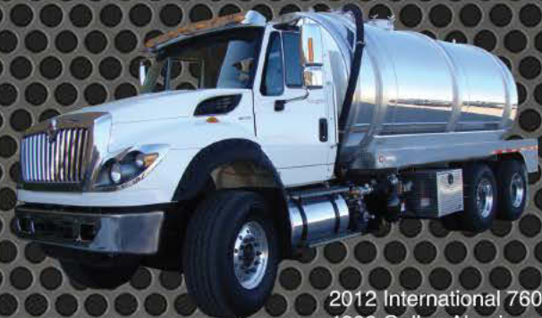
2012 International 7600 4800 Gallon Aluminum