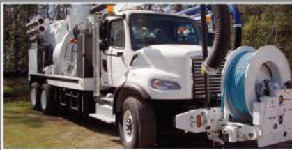
2011 VAC-CON V311LHA-O/1000