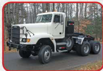
1992 Freightliner 6X6 Winch Daycab $52,500

Detroit 12.7 Series 60, 13 spd., air ride, 12k/40k axles, jake, cruise, diff. lock, sliding 5th wheel, alum. rims, 22.5 rubber, service records, All Arc push bumpers, quarter fenders, heated mirrors, 212" WB, used for tanker hauling, excellent maint. program, records for any repair of replacement parts, some have new clutch's, new motors, transmission, ect.