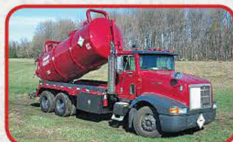
1996 International with Hazardous 3,200 Gal. Keith Huber Vac Truck $79,500

Cummins dsl., 3 spd., EROPS, heat, foot controlled forward/reverse, stabilizers, 33' reach two hyd. one manual extension, 15k cap., SN:11806-90, 1,626 hrs. showing, 12'X76" dimensions, new paint