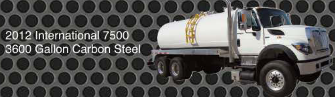
2012 International 7500 3600 Gallon Carbon Steel