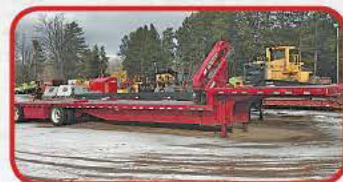
1998 Fruehauf 53 Ft. Stepdeck with Palfinger PK8080 Knuckleboom Crane $22,500

Mercedes-Benz 7.2L @ 300 hp, 8LL trans., full locker, Air Liner susp., 18k/40k axles, air ride cab, 236" WB, alum. front rims, Bluegrass 6 compartment stainless tank