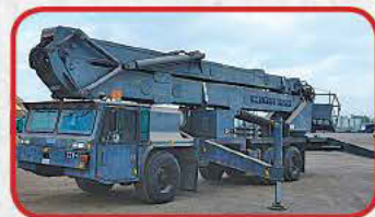
1997 Badger 6X6 with Condor 125S Manlift $89,500

200 gal. freshwater, 500 gal. waste, tandem, cant e lever susp., 20" manway, dumping, Kohler Pro 25 gas driven, Roots blower, pintle hitch, 9.50-16.5 tires, beacon lights