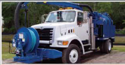
2007 VAC-CON VPD2130BHW/500