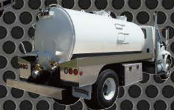
2011 International 7500 2500 Gallon Carbon Steel