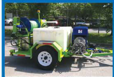
Harben Jetter 4018: Only 411 hours. 18gpm @ 4,000psi. Remanufactured April 2013. All new pump, hoses, paint & full service. Like new! Hatz Silent Pack ..... $21,500