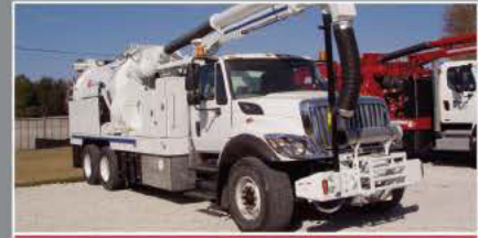
2008 VAC-CON VX312LHE/1300