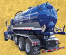
Roll Off Vacuum Tank