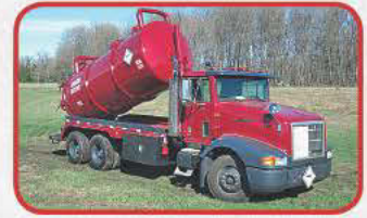
1996 International with Hazardous 3,200 Gal. Keith Huber Vac Truck $79,500

Cummins M11, Allison auto, Hendrickson susp., 21K/40K axles, 212" WB, Condor 26' body, rear mounted 119' 3 section folding boom, 4 hyd. stabilizers, 6X6, 45' 6" length, 12'3" high, 325 hrs., 1,500 miles showing