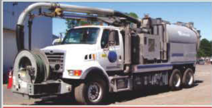
2006 VAC-CON V312LHAD