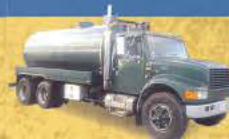
1998 International 4900 International DT 466E Power, 6 spd, 73,500 orig miles, 2 compartment tank 3300/200, Utile vac pump & jetter