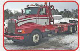
1986 Kenworth T600A Winch Tractor $28,500

Cat C 13, 10 spd., front and rear air ride, jake, 244" WB, 60" sleeper, alum. front rims, Challenger 607 pres/vac unit with 4" fittings, 326K miles showing, unit has a ProHeat system on it, alum. front