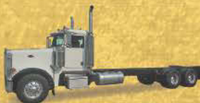
2006 Peterbilt 379 64,000 GVWR, auto trans, 400,000 miles excellent condition, perfect for 4500-5000 aluminum tank.