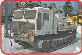
TF 60 Terra Flex Digger Derrick $39,500

33" track width, Detroit 353, AMU 2 winch, outriggers, digger derrick unit with 18" bit and bucket, aux. hyd. to rear, rubber drive sprockets, direct drive trans., heat, enclosed cab, SN:600170781D024