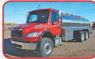
2007 Freightliner M2 106 Stainless Tanker Truck $69,500

Cummins 6BTA @ 158 hp., powershift, enclosed cab with heat and air, quick tach with forks, weight of unit 28,090 lbs., SN:70C15131, new paint