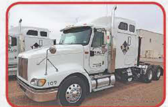
2007 International 9400I Sleeper with Vac Unit $49,500

Detroit 60 Series @ 330 hp., 10 spd., International air ride, 12K/40K axles, power divider, cruise, ac, 2000 Keith Huber Dominator, full opening/dumping tank, DOT 412 with pop offs and grounding cable, emergency shut off, hose tray, hyd. driven Wittig pump, 22.5 on steel rims, battery monitoring system, block heater, tool box, 217" WB, 3,292 hours showing