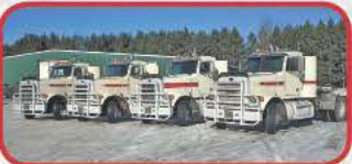
(9) 93-00 Peterbilt 357 DayCabs $29,500 each

Extendable with drop in sections, set up for 4th axle flip, non ground bearing, 102" wide, alum. rims, tri-axle, boom well, outriggers, d-rings, air ride, front flip ramps, frame support, 255/70R22.5 tires, adjustable ride height, 31' in the well