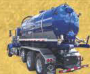
Roll Off Vacuum Tank