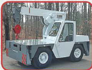
3330C Shuttlelift Carry Deck Crane $16,500

Detroit 60 Series @ 400 HP, Allison HT 740 automatic trans., 18k/52k axles, Hendrickson spring/beam susp., jake, sliding 5th wheel, ether asst. system, 4.89 ratio, pintle, air to rear, wet kit, two spd. transfer case, lowboy ramps, Tulsa 45k winch with 1" cable, 33" tail roller, 22.5 rubber, beacon, 175" WB, tool box's, air driver and pass. seat