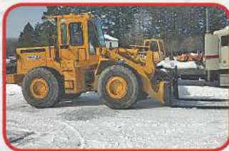
Kawasaki 70Z III Wheel Loader $34,500

Cummins dsl., 3 spd., EROPS, heat, foot controlled forward/reverse, stabilizers, 33' reach two hyd. one manual extension, 15k cap., SN:11806-90, 1,626 hrs. showing, 12'X76" dimensions, new paint