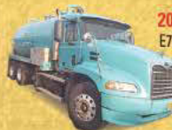
2002 Mack CX612. E7 350 HP, Fuller 10 Spd, 750,643 miles, 4000/200 gallon tank Fruitland RLF500 vac pump, jetter