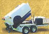
Self Contained Unit 600 gallon steel tank, 33.5 HP Kubota diesel engine (choice of pumps), 200 gallon poly tank, 6 gpm 3,000 psi jetter.