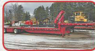
1998 Fruehauf 53 Ft. Stepdeck with Palfinger PK8080 Knuckleboom Crane $22,500

Cat C-13, 10 spd., spring/air susp., 14k/38k axles, 161" cab to center of tandems, 22' total frame, air to rear, pintle, susp. dump, 24.5 rubber, alum. rims, 4.11 ratio, power divider, cruise, jake, ac, 233K showing, Cal. truck "no rust"