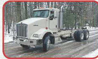
2004 Kenworth T800 Cab and Chassis $49,500

Mercedes-Benz 7.2L @ 300 hp., 8LL trans., full locker, Air Liner susp., 18k/40k axles, air ride cab, 236" WB, alum. front rims, Bluegrass 6 compartment stainless tank