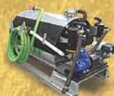
Slide-In Units 500-1,000 gallons, 1 or 2 compartment; select a pump package & engine HP. Standard units "Always in Stock" , all light weight aluminum, many available options.