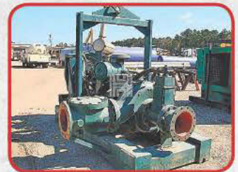
Alco 12 Inch Dewatering Pump $14,500

SCummins 400, Eaton 14615 trans., air ride, 12k/40k axles, 252" WB, lowboy ramps, live roller, Braden Winch, 22.5 rubber