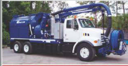
2004 VAC-CON V311LHAD