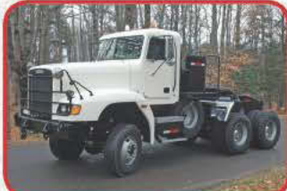
1992 Freightliner 6X6 Winch Daycab $52,500

Detroit 12.7 Series 60, 13 spd., air ride, 12k/40k axles, jake, cruise, diff. lock, sliding 5th wheel, alum. rims, 22.5 rubber, service records, Ali Arc push bumpers, quarter fenders, heated mirrors, 212" WB, used for tanker hauling, excellent maint. program, records for any repair or replacement parts, some have new clutch's, new motors, transmission, ect.