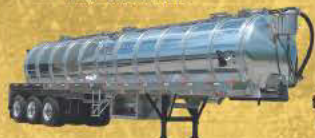
NEW 9000 Gallon Aluminum Vacuum Trailer. Air ride suspension (tri-axle), pump platform, bright finish, LED lights, Betts valves, ON THE GROUND READY FOR DELIVERY.