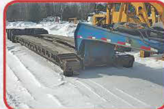
1996 Etnyre 60 Ton Lowboy Bolt in Extendable $59,500

Cat dsl., Allison automatic, spring susp., 14' Dryden lubrication bed, 5 reel dispersal with air, on road diesel/off road diesel/motor oil/hydraulic oil/ oil salvage tank, tool box's, compressor, 11R22.5 tires, 11k/22k axles, 58k showing on odometer