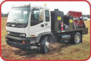
1999 Chevy T7500 Fuel/Lube Truck $16,500

33" track width, Detroit 353, AMU 2 winch, outriggers, digger derrick unit with 18" bit and bucket, aux. hyd. to rear, rubber drive sprockets, direct drive trans., heat, enclosed cab, SN:600170781D024