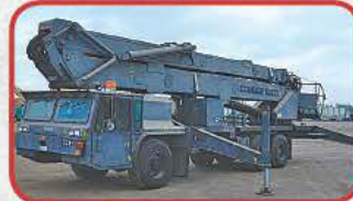
1997 Badger 6X6 with Condor 1255 Manlift $89,500

11' upper, 37' main, 5' beaver with 4' flip ramps, self contained, ratchets, stake pockets, 102" wide, Palfinger PK8080 with outriggers, d-rings, spread axle, air ride, tool box, steel frame with wood floor, 70R22.5 rubber on hub piloted rims, lift cap. of Palfinger 4,012 lbs. @ 13.5', 1,609 lbs. @ 31'