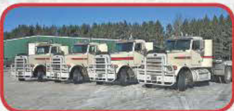
(9) 93-00 Peterbilt 357 DayCabs $29,500 each

Extendable with drop in sections, set up for 4th axle flip, non ground bearing, 102" wide, alum. rims, tri-axle, boom well, outriggers, d-rings, air ride, front flip ramps, frame support, 255/70R22.5 tires, adjustable ride height, 31' in the well