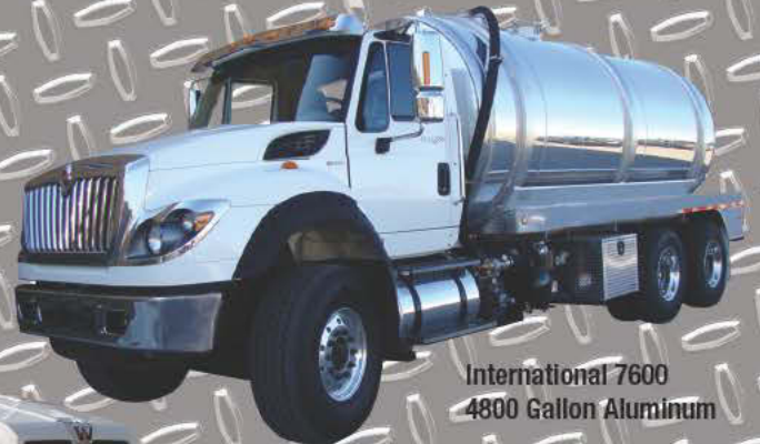
International 7600 4800 Gallon Aluminum