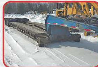
1996 Etryne 60 Ton Lowboy Bolt in Extendable $59,500

Cat dsl., Allison automatic, spring susp., 14' Dryden lubrication bed, 5 reel dispersal with air, on road diesel/off road diesel/motor oil/hydraulic oil/oil salvage tank, tool box's, compressor, 11R22.5 tires, 11k/22k axles, 58k showing on odometer