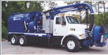
2004 VAC-CON V311LHAD