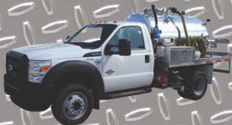
Ford 450 Series 900 Gallon Aluminum