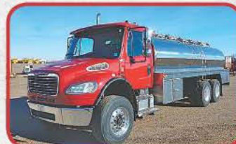
2007 Freightliner M2 106 Stainless Tanker Truck $69,500

Cummins M11, Allison auto, Hendrickson susp., 21K/40K axles, 212" WB, Condor 26' body, rear mounted 119' 3 section folding boom, 4 hyd. stabilizers, 6X6, 45' 6" length, 12'3" high, 325 hrs., 1,500 miles showing