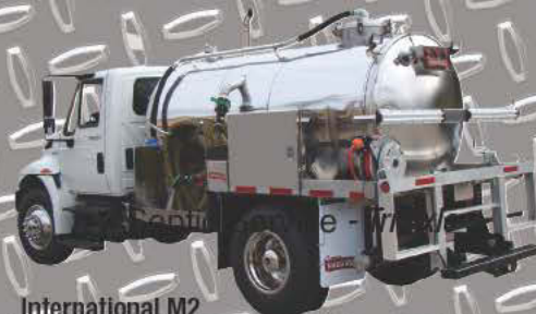
International M2 2000 Gallon Aluminum