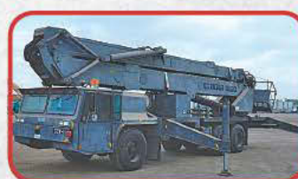
1997 Badger 6X6 with Condor 1255 Manlift $89,500

11' upper, 37' main, 5' beaver with 4' flip ramps, self contained, ratchets, stake pockets, 102" wide, Palfinger PK8080 with outriggers, d-rings, spread axle, air ride, tool box, steel frame with wood floor, 70R22.5 rubber on hub piloted rims, lift cap. of Palfinger 4,012 lbs. @ 13.5', 1,609 lbs. @ 31'