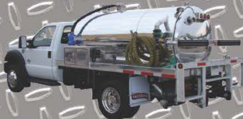
Ford 550 Series 1200 Gallon Aluminum