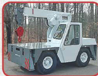
3330C Shuttlelift Carry Deck Crane $16,500

Detroit 60 Series @ 400 HP, Allison HT 740 automatic trans., 18k/52k axles, Hendrickson spring/beam susp., jake, sliding 5th wheel, ether asst. system, 4.89 ratio, pintle, air to rear, wet kit, two spd. transfer case, lowboy ramps, Tulsa 45k winch with 1" cable, 33" tail roller, 22.5 rubber, beacon, 175" WB, tool box's, air driver and pass. seat