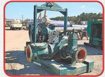
Alco 12 Inch Dewatering Pump P.O.R.

Mercedes-Benz 7.2L @ 300 hp., 8LL trans., full locker, Air Liner susp., 18k/40k axles, air ride cab, 236" WB, alum. front rims, Bluegrass 6 compartment stainless tank