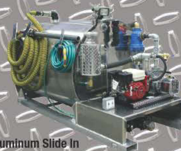
Aluminum Slide In

Contact any one of the progress vactruck distributors shown below.