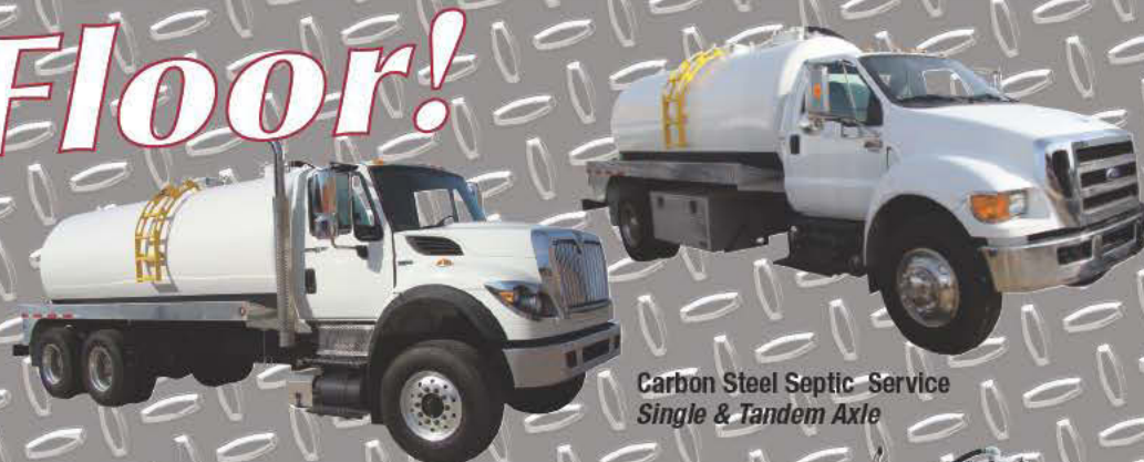
Carbon Steel Septic Service Single & Tandem Axle