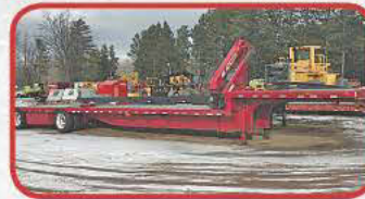
1998 Fruehauf 53 Ft. Stepdeck with Palfinger PK8080 Knuckleboom Crane $22,500

Cat C-13, 10 spd., spring/air susp., 14k/38k axles, 161" cab to center of tandems, 22' total frame, air to rear, pintle, susp. dump, 24.5 rubber, alum. rims, 4.11 ratio, power divider, cruise, jake, ac, 233K showing, Cal. truck "no rust"