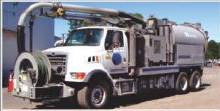
2006 VAC-CON V312LHAD