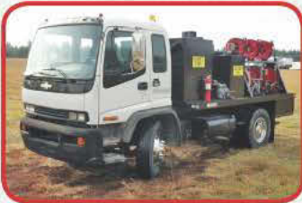
1999 Chevy T7500 Fuel/Lube Truck $16,500

33" track width, Detroit 353, AMU 2 winch, outriggers, digger derrick unit with 18" bit and bucket, aux. hyd. to rear, rubber drive sprockets, direct drive trans., heat, enclosed cab, SN:600170781D024