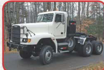
1992 Freightliner 6X6 Winch Daycab $52,500

Detroit 12.7 Series 60, 13 spd., air ride, 12k/40k axles, jake, cruise, diff. lock, sliding 5th wheel, alum. rims, 22.5 rubber, service records, All Arc push bumpers, quarter fenders, heated mirrors, 212" WB, used for tanker hauling, excellent maint. program, records for any repair or replacement parts, some have new clutch's, new motors, transmission, ect.