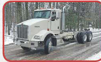
2004 Kenworth T800 Cab and Chassis $49,500

Cummins 6BTA @ 158 hp., powershift, enclosed cab with heat and air, quick tach with forks, weight of unit 28,090 lbs., SN:70C1 5131, new paint