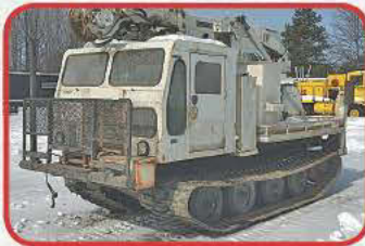
TF 60 Terra Flex Digger Derrick $39,500

33" track width, Detroit 353, AMU 2 winch, outriggers, digger derrick unit with 18" bit and bucket, aux. hyd. to rear, rubber drive sprockets, direct drive trans., heat, enclosed cab, SN:600170781D024