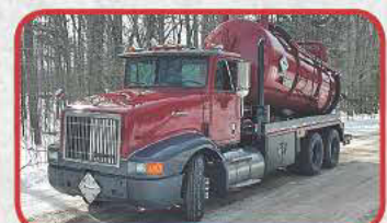
1996 International with Hazardous 3,200 Gal. Keith Huber Vac Truck $79,500

SCummins 400, Eaton 14615 trans., air ride, 12k/40k axles, 252" WB, lowboy ramps, live roller, Braden Winch, 22.5 rubber