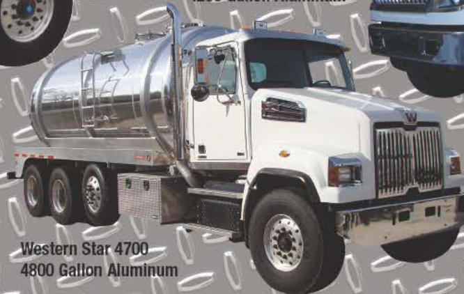
Western Star 4700 4800 Gallon Aluminum