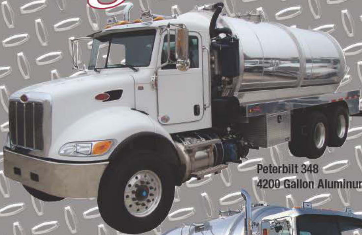
Peterbilt 348 4200 Gallon Aluminum