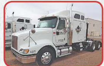
2007 International 9400I Sleeper with Vac Unit $49,500

Model 12NHTA-PF6m, VT-WT Series, dsl. power, skid mount, 12" line, SN:97026110, hours showing 7,157