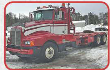
1986 Kenworth T600A Winch Tractor $28,500

Cat C 13, 10 spd., front and rear air ride, jake, 244" WB, 60" sleeper, alum. front rims, Challenger 607 pres/vac unit with 4" fittings, 326K miles showing, unit has a ProHeat system on Itratio, alum. front