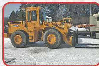
Kawasaki 70Z III Wheel Loader $34,500

Cummins dsl., 3 spd., EROPS, heat, foot controlled forward/reverse, stabilizers, 33' reach two hyd. one manual extension, 15k cap., SN:11806-90, 1,626 hrs. showing, 12'X76" dimensions, new paint