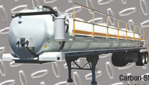
Carbon Steel, Aluminum & Stainless Trailers