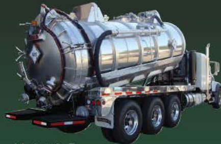
Hoist & Door