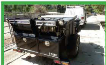
2009 American Sewer Jetter: 25 gpm, 4,000 psi, 300 gallons, 500 foot hose, includes additional line, sizes and heads. Original private owner bought for one job, 67 hours on the machine, 50 hp, dual gas. Paid 22k, sell for.....$7,500 Office 818-951-6100 Cell 310-420-3525 C02

2008 Spartan 758 trailer jetter, stored and transported in an enclosed trailer, excellent condition with low hours, 1 person owner/operator. $9,900. Call 1-507-323-4115, MN. (C01)