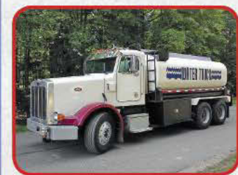
1997 Peterbilt 3,650 Gal. Water Truck $37,500

74" spread between axles, 7,200 gal. cap., alum. rims, 4" camlock off rear, air up/down pusher, single compartment, DOT 407SS rated, air ride, reworked frame, sandblasted and painted