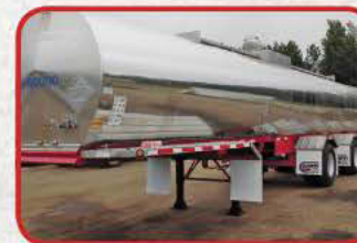
2000 Tremcar 7,200 Gal. Quad-Axle Tanker $59,500

300 Mack, 2 stick 4X5 updated Transmission w/ Power Torque, 20k front/58k rear, three winch system, 1st winch Braden MS50, 2nd winch Braden MS20, 3rd winch Braden 30K, new 21' poles, full 3/4 tail roller 100", 285R22.5 drive tires, 12.00R24 steer, block heater, camelback susp., rear drives @80%, front steers @ 75%, 20' bed, 282"WB, exceptionally clean unit