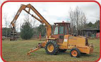
Case 586E Loader with Grapple $9,500

Cat C-10 @ 350 HP, Allison auto, Hendrickson spring/beam susp., power divider, cruise, Vac-Con Model: PD4211LHAN, 8,658 hrs., telescoping boom, strobes, full opening dumping tank, Roots blower, high pressure wand, central grease system, water tanks, direct drive hyd. pump, remote, hyd. leg reel support