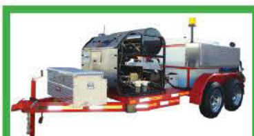
Xtreme Flow Hot/Cold Jetter! Model #HJ2TA8536, tandem axle trailer, 35 hp Vanguard 8.5 gpm @ 3,600 psi, 325 gallon water tank, 300' hose, General Pump. List $34,995. On sale for $29,995. Fully loaded! 800-213-3272 www.hotjetusa.com CPBM