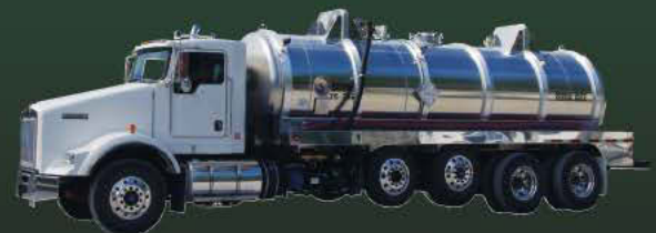
D.O.T. Code Oilfield Pumper