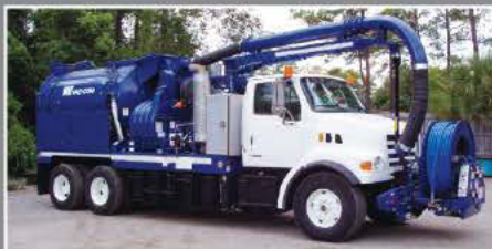
2004 VAC-CON V311LHAD