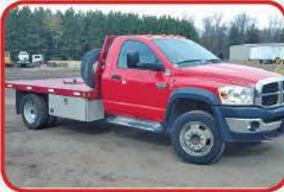
2010 Dodge SLT 5500HD 4X4 Flatbed $34,500

DT 466 @ 210 HP, automatic trans., air ride, cruise/AC, block heater, 22.5 tires, htd. mirrors, Epsom ticket writer, susp. dump, single line dispersal, dual two compartment steel tank, 925/925 gal., Scully overflow monitor system, CalPro counter system, grounding system, emergency shut off, 185" WB, 10,250/17,500 lbs. axles, hub piloted steel rims