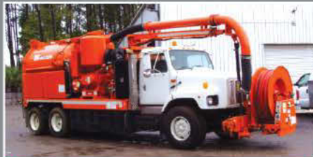
2000 VAC-CON VPD3609SHA