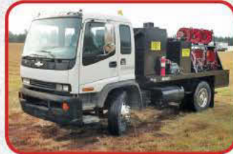
1999 Chevy T7500 Fuel/Lube Truck $16,500

Cummins turbo dsl. 6.7L, automatic with overdrive, spring susp., 7k/13,500 axles, electric to rear, 11"X96" flatbed, spare tire, alum. tool box's, pintle hitch, alum. running boards, electric windows and door locks, cd, 169" WB