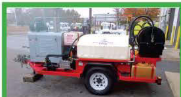
Spartan 798 diesel jetter (Only 149 hours). Like brand new, fresh service, 18 gpm @ 4,000 psi with antifreeze system, work ready. ....$16,900 Call 800-627-0778 C01

2011 Mongoose 184 tow behind jetter: Single axle, 300 gallon water tank, Caterpillar engine, 600 hours, no highway miles. Unit is in great shape. Located in Orlando, FL. Call 267-249-3774. $23,500. (C01)