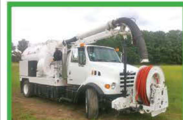
2003 Sterling L7500 Vac Truck: CAT 3125 @ 315 hp, A/T, 55k miles, spring susp., 2003 Vac-Con V390LHAD, 3 compressor fans, 10' telescopic boom, HS drive, articulating hose reel, hi-dump debris tank. ....$79,500 715-546-2680 WI CBM

2007 Vac-Con model VPD4212LHAE on a International model 7400 with an automatic transmission, Roots 827 PD blower, 80 gpm @ 2,000 psi, rebuilt water pump, 800 foot, 1" jet hose, 12-yd. debris tank, extendible boom, articulating hose reel, new white paint. Pictures at www.empireequip.com . $159,500. Call 714-639-8352, CA. (CP01)