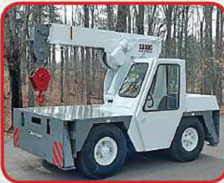
3330C Shuttlelift Carry Deck Crane $16,500

Cummins ISM @ 320 HP, 10 spd., Hendrickson air ride, power divider, ac, 160" WB, 12k/40k axles, single line wet kit, stationary 5th wheel, susp. dump, miles showing 177k-195k