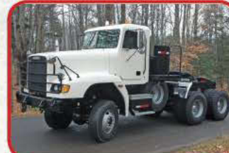
1992 Freightliner 6X6 Winch Daycab $52,500

C-15 @ 435 HP, Airliner air/spring susp., heavy 10 spd., full lockers, wet kit, htd. mirrors/block heater, AC, power windows, dual alum. fuel tanks, dual stacks, alum. rims, 22.5 rubber, 14,600 lbs. front/46k rear, air up/down pusher, 236" WB, 1984 Fruehauf ring vacuum tanker, 6,200 USG, 8' 3" on spreads, tri-axle, front axle is a air up/down pusher, New hyd. driven, 607 Challenger PresVac pump, DOT 312SS, air ride, hose trays, alum. rims