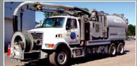
2006 VAC-CON V312LHAD