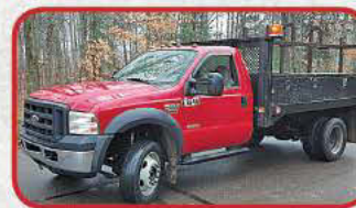
2007 Ford F550 XL Flatbed Truck $14,500

Case 4-390 @ 63 HP, enclosed cab, power shift trans., 4,002 hrs. showing, 13,900 lbs. machine, counterweights, 21'6" lift height, 6k cap., Coastal Hyd. crane, non continuous butt grapple, outriggers