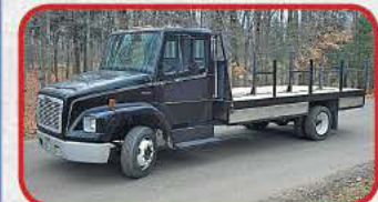
2003 Freightliner FL50 Flatbed $12,500

Ford Powerstroke turbo dsl. 6.0L, automatic, spring susp., AC, beacons, 2WD, dual 225/75R19.5, pintle hitch with electric rear, tool box's, ladder rack, 6k/13,660lbs. axles, 165"WB, 11'X8' flatbed