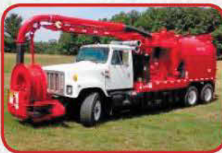
2002 International 2574 Jet/Vac Truck $139,500

Cummins dsl, 10 spd., air/spring susp., power divider, ac, 22.5 rubber, steel rims rear, alum. front, 3,650 gal. cap., front drivers and rear spray bar, New 3" pto driven pump, alum. fuel tanks