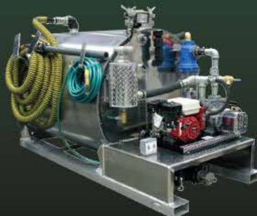
Aluminum Slide In