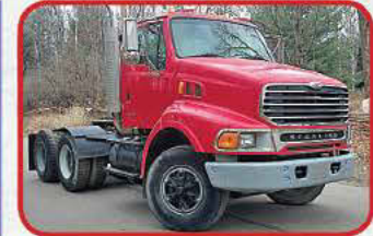
(4) 2003 L9500 Sterling Day Cabs $22,500 each; $78,000 Group

Detroit 60 Series @ 400 HP, Allison HT 740 automatic trans., 18k/52k axles, Hendrickson spring/beam susp., jake, sliding 5th wheel, ether asst. system, 4.89 ratio, pintle, air to rear, wet kit, two spd. transfer case, lowboy ramps, Tulsa 45k winch with 1" cable, 33" tail roller, 22.5 rubber, beacon, 175" WB, tool box's, air driver and pass. seat