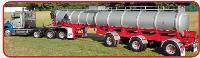
2006 Sterling Tri-Axle Day Cab with Fruehauf Vac Tanker Combo $39,500 Tractor/$59,500 Trailer

Cat dsl., Allison automatic, spring susp., 14' Dryden lubrication bed, 5 reel dispersal with air, on road diesel/off road diesel/motor oil/hydraulic oil/ oil salvage tank, tool box's, compressor, 11R22.5 tires, 11k/22k axles, 58k showing on odometer