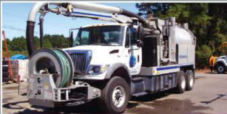
2005 VAC-CON V312LHAD