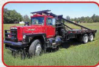
1981 Mack RD686SX Rig Up Unit $59,500

Cummins dsl., 3 spd., EROPS, heat, foot controlled forward/reverse, stabilizers, 33' reach two hyd. one manual extension, 15k cap., SN:11806-90, 1,626 hrs showing, 12'X76" dimensions, new paint