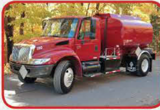
2006 International 4300 2 Compartment Fuel Truck $49,500

DT 466 @ 210 HP, automatic trans., air ride, cruise/AC, block heater, 22.5 tires, htd. mirrors, Epsom ticket writer, susp. dump, single line dispersal, dual two compartment steel tank, 925/925 gal., Scully overflow monitor system, CalPro counter system, grounding system, emergency shut off, 185" WB, 10,250/17,500 lbs. axles, hub piloted steel rims