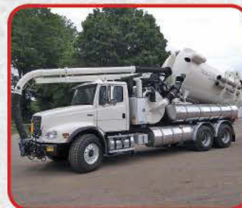
2001 Freightliner FL 112 Vactor 2100 Vac Truck $119,500

Cat C-15 @ 466 HP, tandem, 4,000 gal. cap., 2008 Jurop LC 420 pump, 610k miles showing, tool box's, U.S. Tank company, 3' manway, dual air cleaner, dual stack, Jake, cruise, AC, 13 spd., 6" valve heater, air ride, susp. dump, power mirrors, htd. mirrors, hose trays, 250" WB, 12k/38k axles, alum. rims