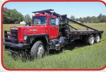
1981 Mack RD686SX Rig Up Unit $59,500

Cat 3306 @ 300 HP, 10 spd., 240" WB, 18k front, 45k rear, boom kit, 1/2 opening rear, dumping, hazmat tank and pump, Manufactured by Guzzler