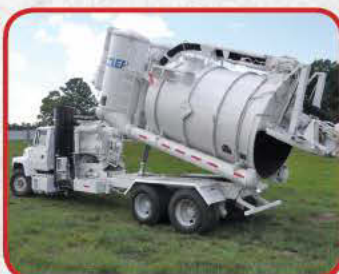
1995 Ford L9000 with Guzzler Hazardous Unit $69,500

DT 466 @ 195 HP, Allison auto, spring susp., 123k miles showing, 4.56 ratio, 10' box, 12' hydro turn plow, beacons, 12k/21k axles, 170" WB, 22.5 tires