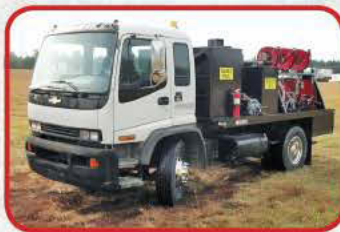
1999 Chevy T7500 Fuel/Lube Truck $16,500

Cummins turbo dsl. 6.7L, automatic with overdrive, spring susp., 7k/13,500 axles, electric to rear, 11'X9'6" flatbed, spare tire, alum. tool box's, pintle hitch, alum. running boards, electric windows and door locks, cd, 169" WB