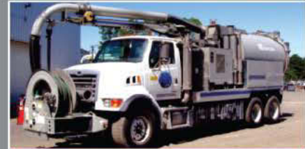
2006 VAC-CON V312LHAD