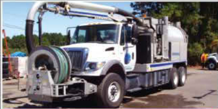
2005 VAC-CON V312LHAD