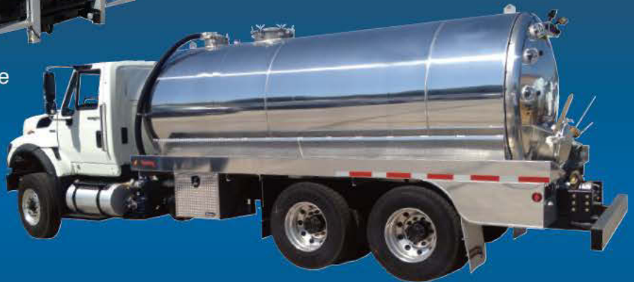
Septic Service - Tandem Axle