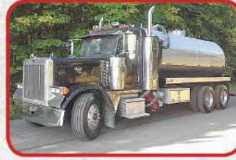
2006 Peterbilt 379 4,000 gal. Pres/Vac Unit $99,500

Cat C-10 @ 350 HP, Allison auto, Hendrickson spring/beam susp., power divider, cruise, Vac-Con Model: PD4211LHAN, 8,658 hrs., telescoping boom, strobes, full opening dumping tank, Roots blower, high pressure wand, central grease system, water tanks, direct drive hyd. pump, remote, hyd. leg reel support