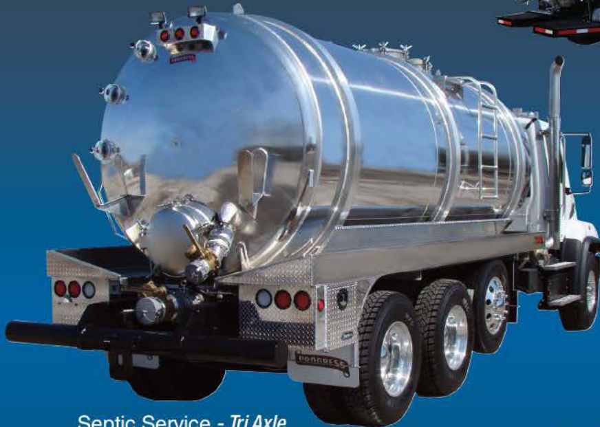
Septic Service - Tri Axle

Aluminum • Stainless Steel • Carbon Steel