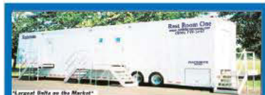
Six 53-foot mobile restroom trailers in excellent condition for sale. $89,000/ea. Call 800-749-3247 x15 for details, or visit www.mobilerestrooms.com P12

3 Decons, 28' Tonto, 18' Royal, 2001 ASCI, 16' Presidential, 26' Presidential, portable toilet hauler trailers, like new PolyPortables handicaps. 315-437-1291, NY. (PBM)