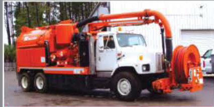
2000 VAC-CON VPD3609SHA