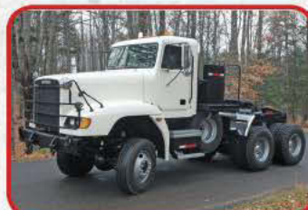
1992 Freightliner 6X6 Winch Daycab $52,500

C-15 @ 435 HP, Airliner air/spring susp., heavy 10 spd., full lockers, wet kit, htd. mirrors/block heater, AC, power windows, dual alum. fuel tanks, dual stacks, alum. rims, 22.5 rubber, 14,600 lbs. front/46k rear, air up/down pusher, 236" WB, 1984 Fruehauf ring vacuum tanker, 6,200 USG, 8' 3" on spreads, tri-axle, front axle is a air up/down pusher, New hyd. driven, 607 Challenger PresVac pump, DOT 312SS, air ride, hose trays, alum. rims