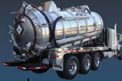
Hoist & Door

Aluminum • Stainless Steel • Carbon Steel