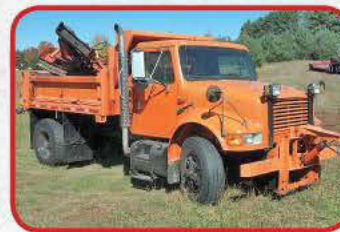
1994 International Single Axle Plow Truck $12,500

Detroit 60 Series @ 400 HP, Allison HT 740 automatic trans., 18k/52k axles, Hendrickson spring/beam susp., Jake, sliding 5th wheel, ether asst. system, 4.89 ratio, pintle, air to rear, wet kit, two spd. transfer case, lowboy ramps, Tulsa 45k winch with 1" cable, 33" tall roller, 22.5 rubber, beacon, 175" WB, tool box's, air driver and pass. seat