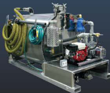
Aluminum Slide In