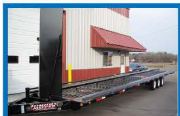
New Johnny Mover portable restroom hauling trailers in stock. New 20-unit mover and 12-unit mover ready for delivery. 715-723-4450 WI P12

Restroom trailers: Two, three and six station now in stock. A Restroom Trailer Company (Art Company), 269-435-4278, info@arestroomtrailer.com , www.arestroomtrailer.com . (PTBM)