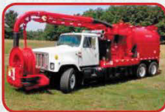
2002 International 2574 Jet/Vac Truck $139,500

C-12 @ 430 hp., 8LL trans., Hendrickson spring/beam susp., 12,860 lbs. front/46k rear, 4.33 ratio, ac/Jake/cruise, power divider, full opening/dumping rear, vibrator, dbl. frame, Transway TSI 1200 pres/vac pump, hose trays, tool box, dual 4" off rear, 4,200 gal. cap., pressure washer/mini jet