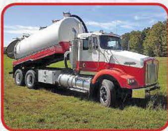
2002 Kenworth T800 Single Barrel Pres/Vac Truck $95,000

Cummins dsl, 10 spd., air/spring susp., power divider, ac, 22.5 rubber, steel rims rear, alum. front, 3,650 gal. cap., front drivers and rear spray bar, New 3" pto driven pump, alum. fuel tanks