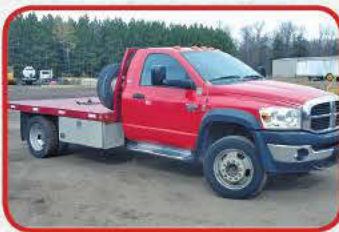
2010 Dodge SLT 5500HD 4X4 Flatbed $34,500

DT 466 @ 210 HP, automatic trans., air ride, cruise/AC, block heater, 22.5 tires, htd. mirrors, Epsom ticket writer, susp. dump, single line dispersal, dual two compartment steel tank, 925/925 gal., Scully overfill monitor system, CalPro counter system, grounding system, emergency shut off, 185" WB, 10,250/17,500 lbs. axles, hub piloted steel rims