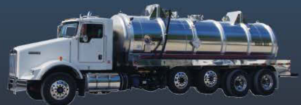
D.O.T. Code Oilfield Pumper