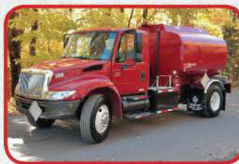
2006 International 4300 2 Compartment Fuel Truck $49,500

DT 466 @ 210 HP, automatic trans., air ride, cruise/AC, block heater, 22.5 tires, htd. mirrors, Epsom ticket writer, susp. dump, single line dispersal, dual two compartment steel tank, 925/925 gal., Scully overfill monitor system, CalPro counter system, grounding system, emergency shut off, 185" WB, 10,250/17,500 lbs. axles, hub piloted steel rims