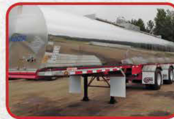
2000 Tremcar 7,200 Gal. Quad-Axle Tanker $59,500

300 Mack, 2 stick 4X5 updated Transmission w/ Power Torque, 20k front/58k rear, three winch system, 1st winch Braden MS50, 2nd winch Braden MS20, 3rd winch Braden 30K, new 21' poles, full 3/4 tall roller 100", 285R22.5 drive tires, 12.00R24 steer, block heater, camelback susp., rear drives @80%, front steers @75%, 20' bed, 282" WB, exceptionally clean unit