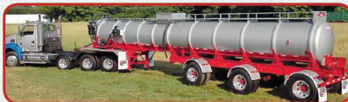
2006 Sterling Tri-Axle Day Cab with Fruehauf Vac Tanker Combo $49,500 Tractor/$59,500 Trailer

Cat dsl., Allison automatic, spring susp., 14' Dryden lubrication bed, 5 reel dispersal with air, on road diesel/off road diesel/motor oil/hydraulic oil/oil salvage tank, tool box's, compressor, 11R22.5 tires, 11k/22k axles, 58k showing on odometer