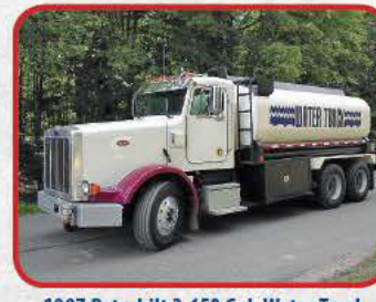
1997 Peterbilt 3,650 Gal. Water Truck $37,500

74" spread between axles, 7,200 gal. cap., alum. rims, 4" camlock off rear, air up/down pusher, single compartment, DOT 407SS rated, air ride, reworked frame, sandblasted and painted