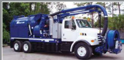
2004 VAC-CON V311LHAD