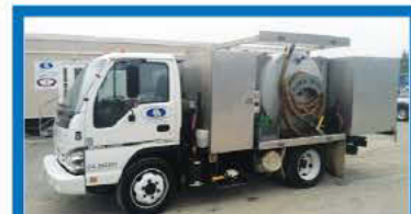
2006 Isuzu FMI workmate: Truck has a lift gate and can haul 6 toilets with out a trailer, 600 gallon waste, 350 fresh water, 147,000 miles, truck runs and looks great. ....$29,000 Call 707-496-2986 CA P12