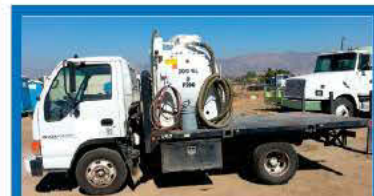
1995 ISUZU NPR: V-8 gas, 134,000 miles, 300 waste, 120 fresh, hauls 4 toilets, runs daily. California. ....$8,300. 661-972-4876 CA P12

1999 Ford F-800, 5.9 Cummins, Allison automatic, 225 fresh/1,050 waste with Condé SDS 12 pump. Fresh water is stainless steel, 2-unit rack, runs and operates good. $10,000. 662-415-7054. (P01)